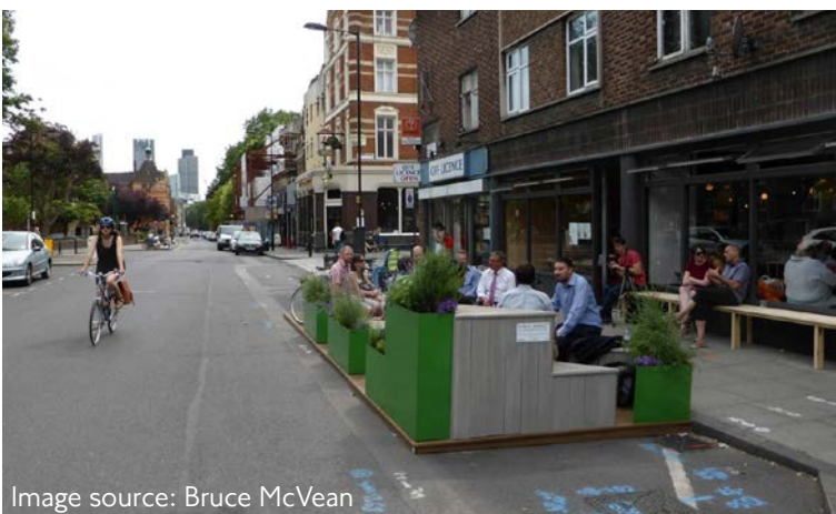
Chatsworth Road, LB Hackney

Space for parking can be converted to provide temporary or seasonal seating.