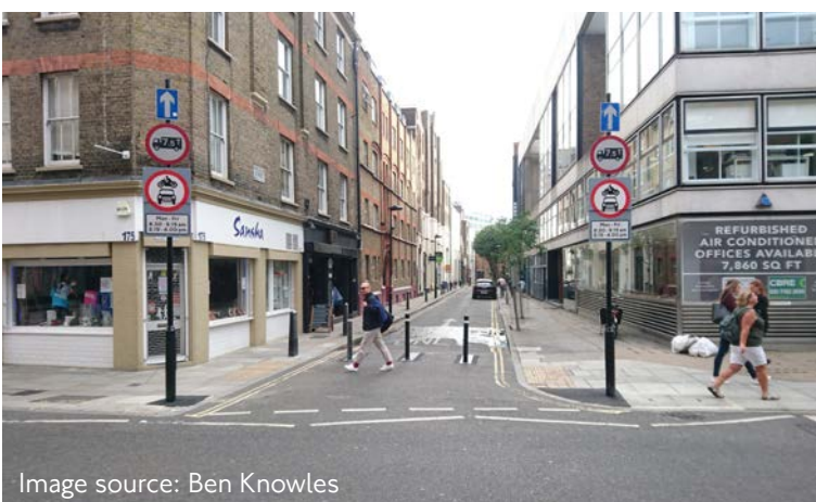
Blackhorse Road, LB Waltham Forest

Closing streets around schools to traffic at the start and end of the school day helps promote walking and cycling and reduce short car trips, and provides a safe space for children and parents.