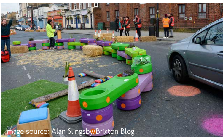
Tooley Street, LB Southwark

Engaging local communities when developing proposals helps ensure changes will work for everyone. Trialling changes before designing a final scheme can help highlight the potential for change and address people's concerns about the effect of alterations to the street.