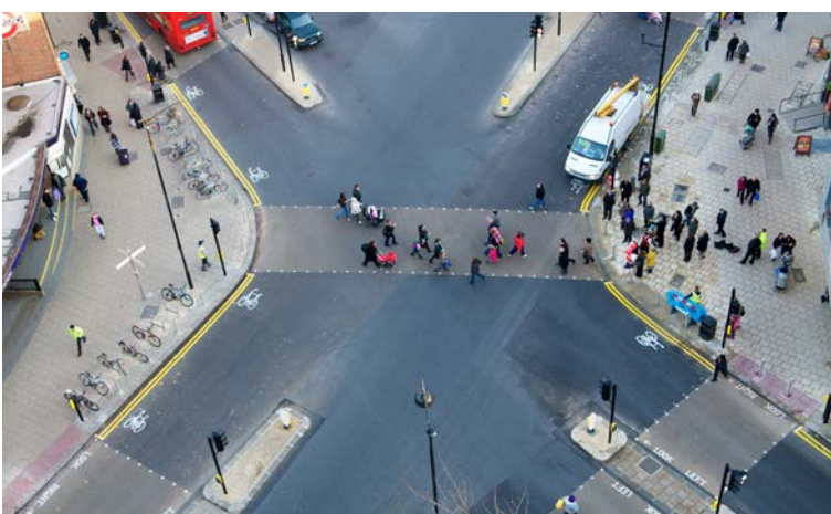
Catford Road, LB Lewisham

Crossings should be as direct as possible but on streets with very heavy traffic it is sometimes necessary to split pedestrian crossings, providing space for people to wait in the middle of the road. This space needs to be large enough to comfortably accommodate people waiting to cross.