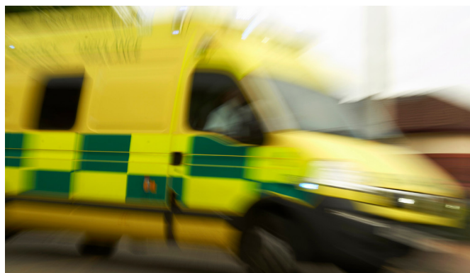
The situation is urgent

London politicians could do more to fix this. The NHS' ability to deal with staff shortages through the usual channels is being limited by the Government's continuing failure to agree a long term plan for its recruitment and development funding. Helping Londoners get the right skills and cope with the cost of living is achievable and would start to address two of the most pressing issues until the Government gets its act together.