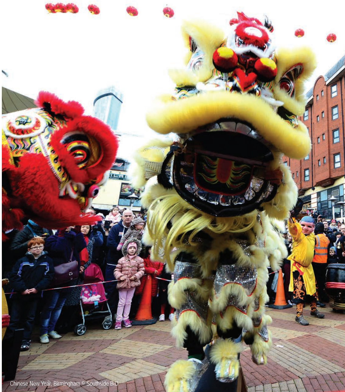
Chinese New Year, Birmingham

Southside includes two culturally distinct areas – Chinatown and the Gay Village – which had co-existed for 30 years, but remained separate. The BID brings these communities together under a new umbrella organisation working to regenerate the Southside area. Four cultural organisations united to provide leadership and set up the BID. They have continued to use their influence to connect the area to wider networks in the city and beyond. The BID has also helped to bring in new visitors to support the local service sector.