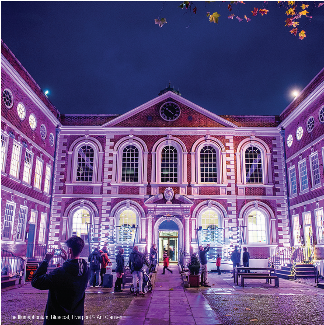
The Illumaphonium, Bluecoat, Liverpool