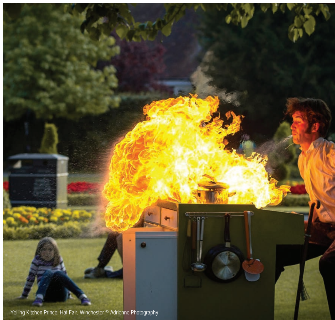
Yelling Kitchen Prince, Hat Fair, Winchester