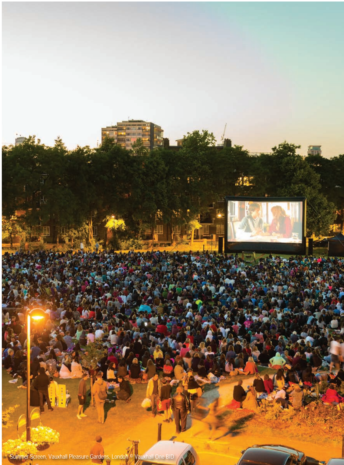
Summer Screen, Vauxhall Pleasure Gardens, London