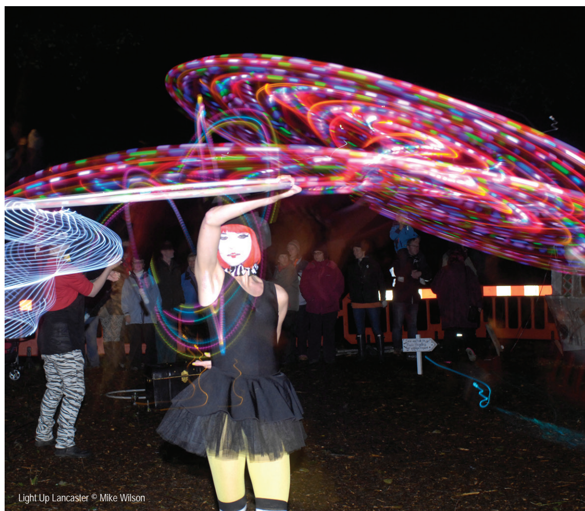
Light Up Lancaster