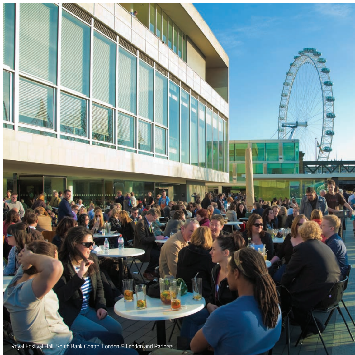
Royal Festival Hall, South Bank Centre, London