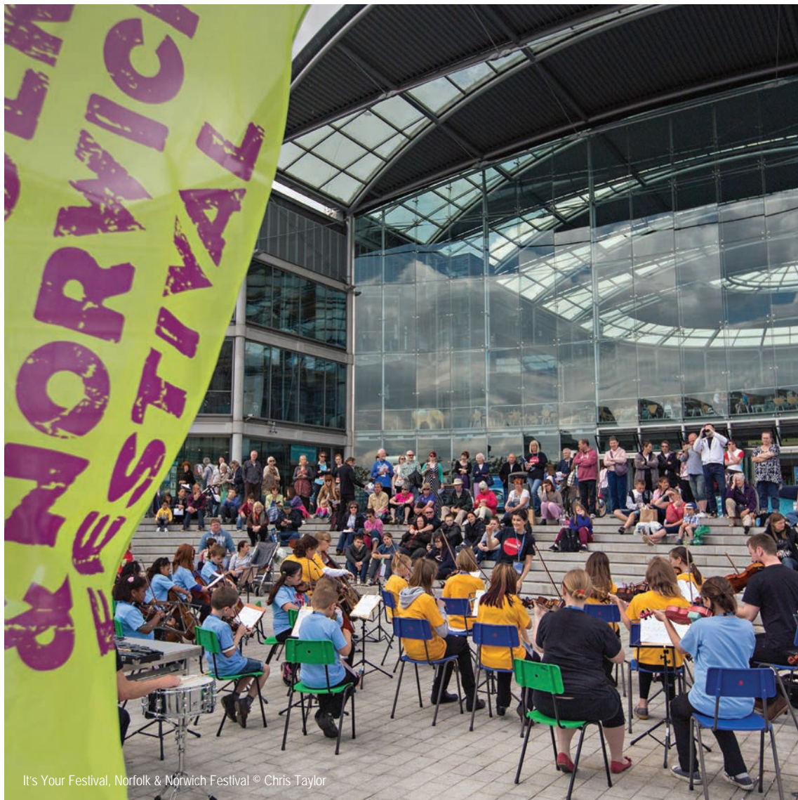
It's Your Festival, Norfolk & Norwich Festival