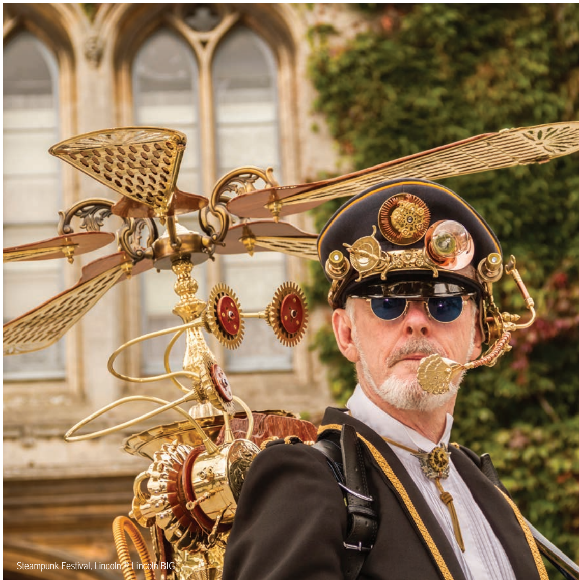
Steampunk Festival, Lincoln