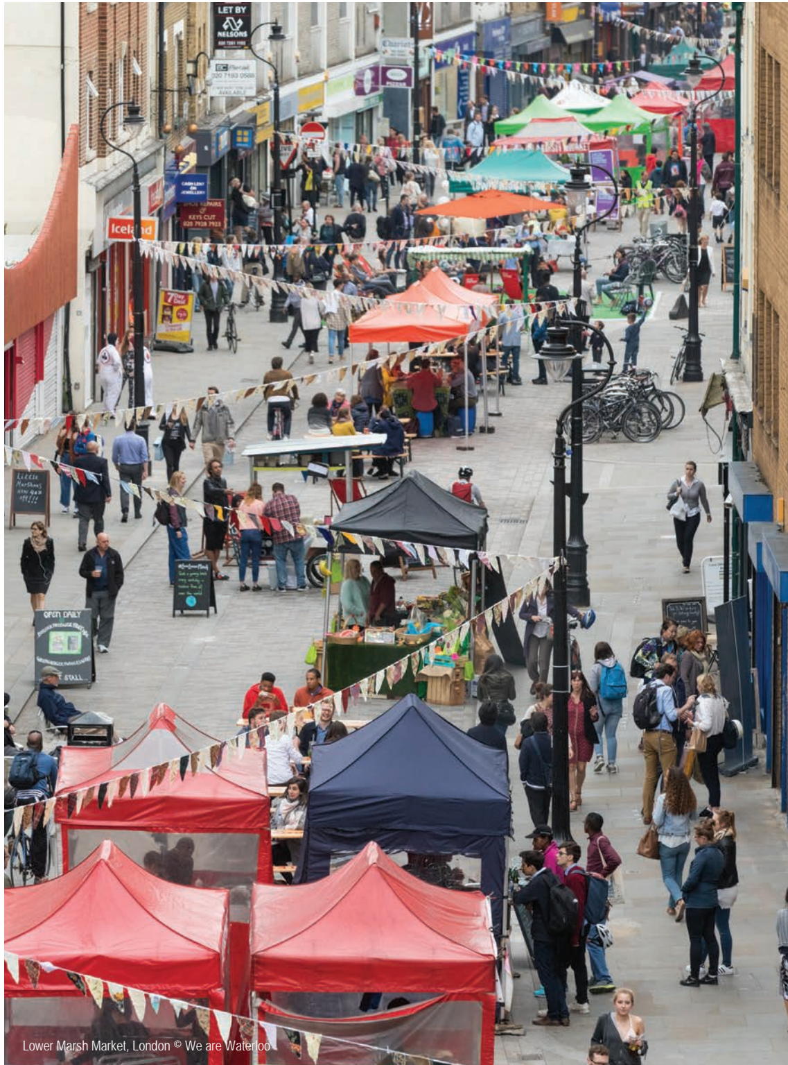
Lower Marsh Market, London