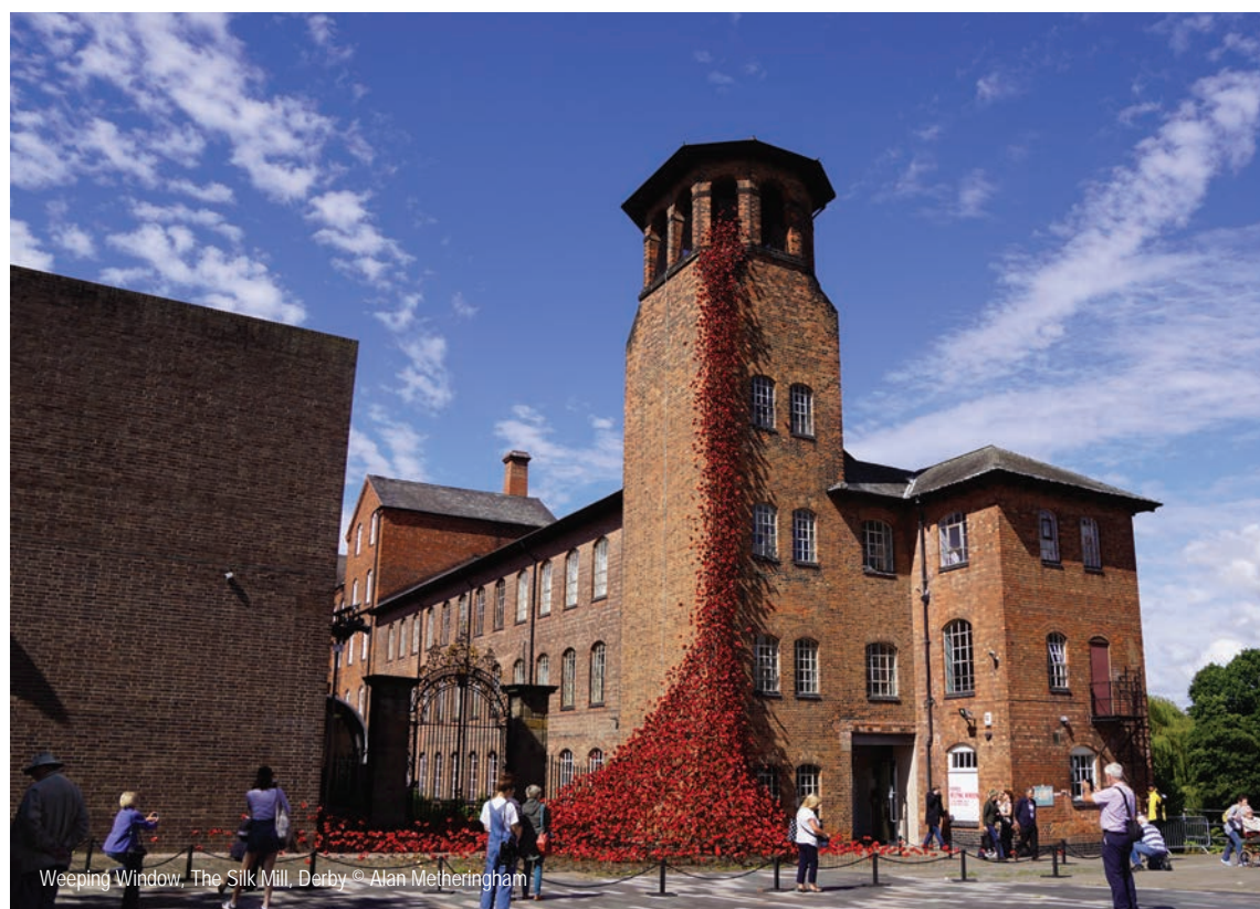
Weeping Window, The Silk Mill, Derby