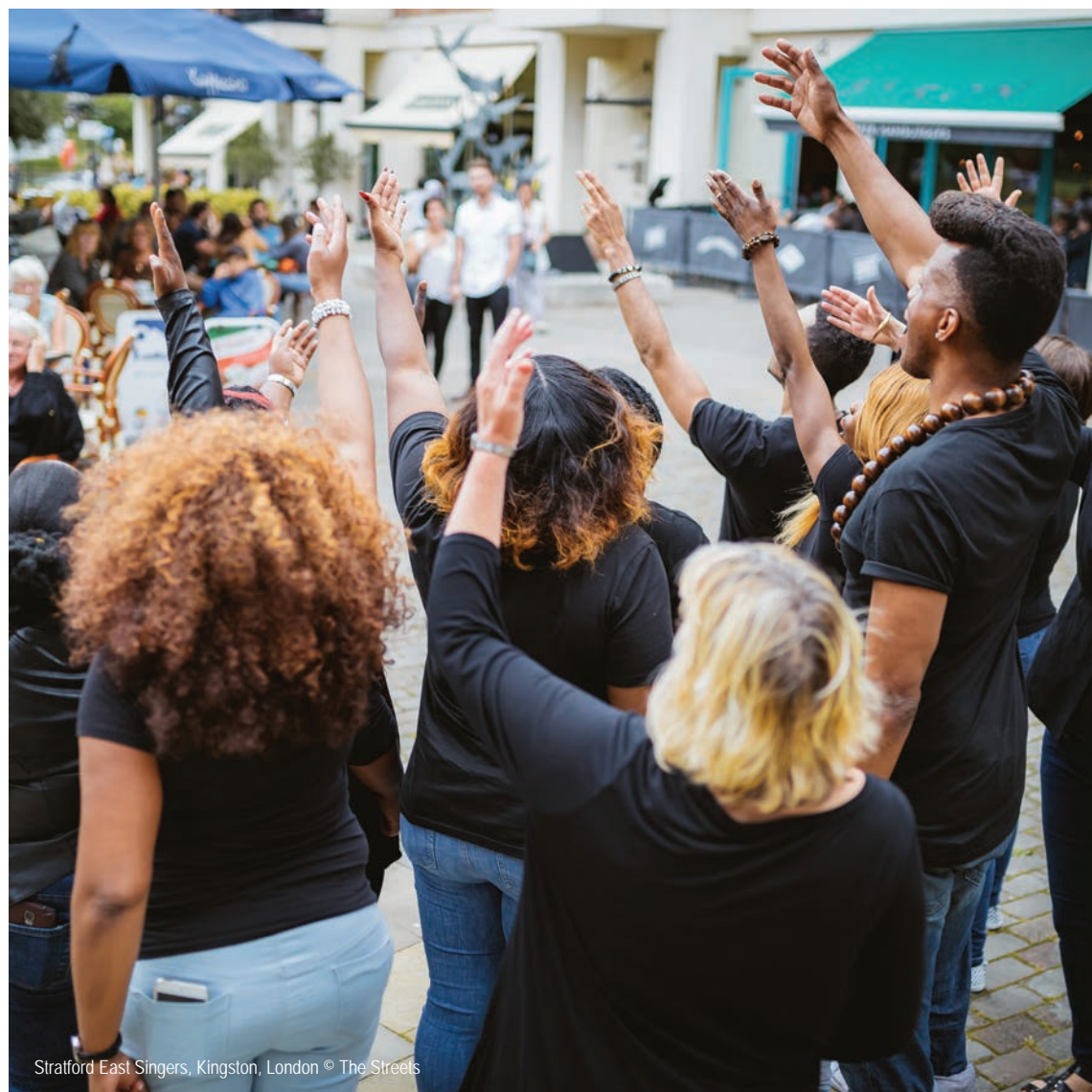
Stratford East Singers, Kingston, London