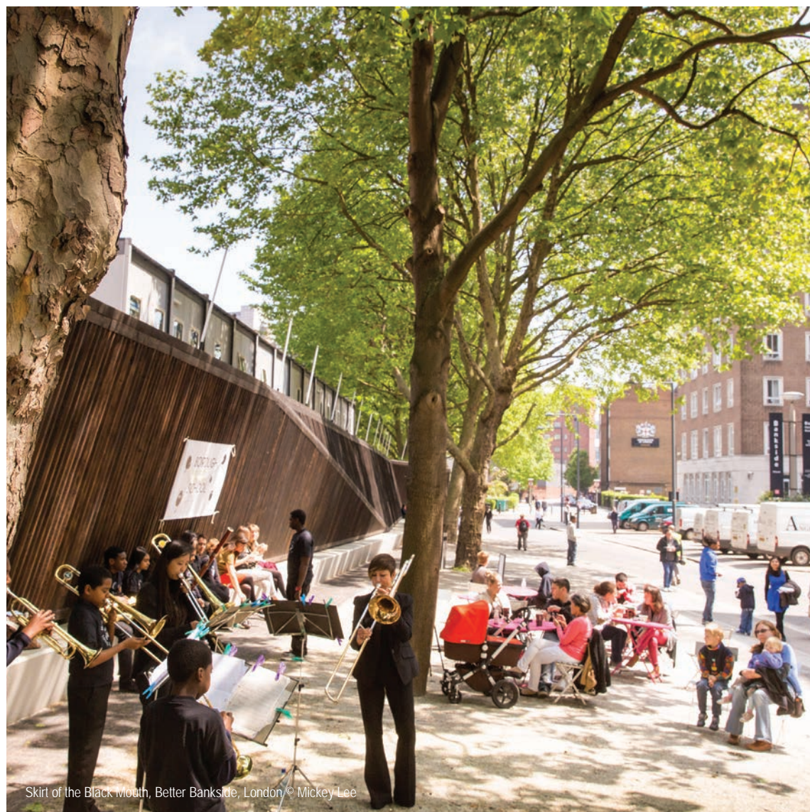
Skirt of the Black Mouth, Better Bankside, London