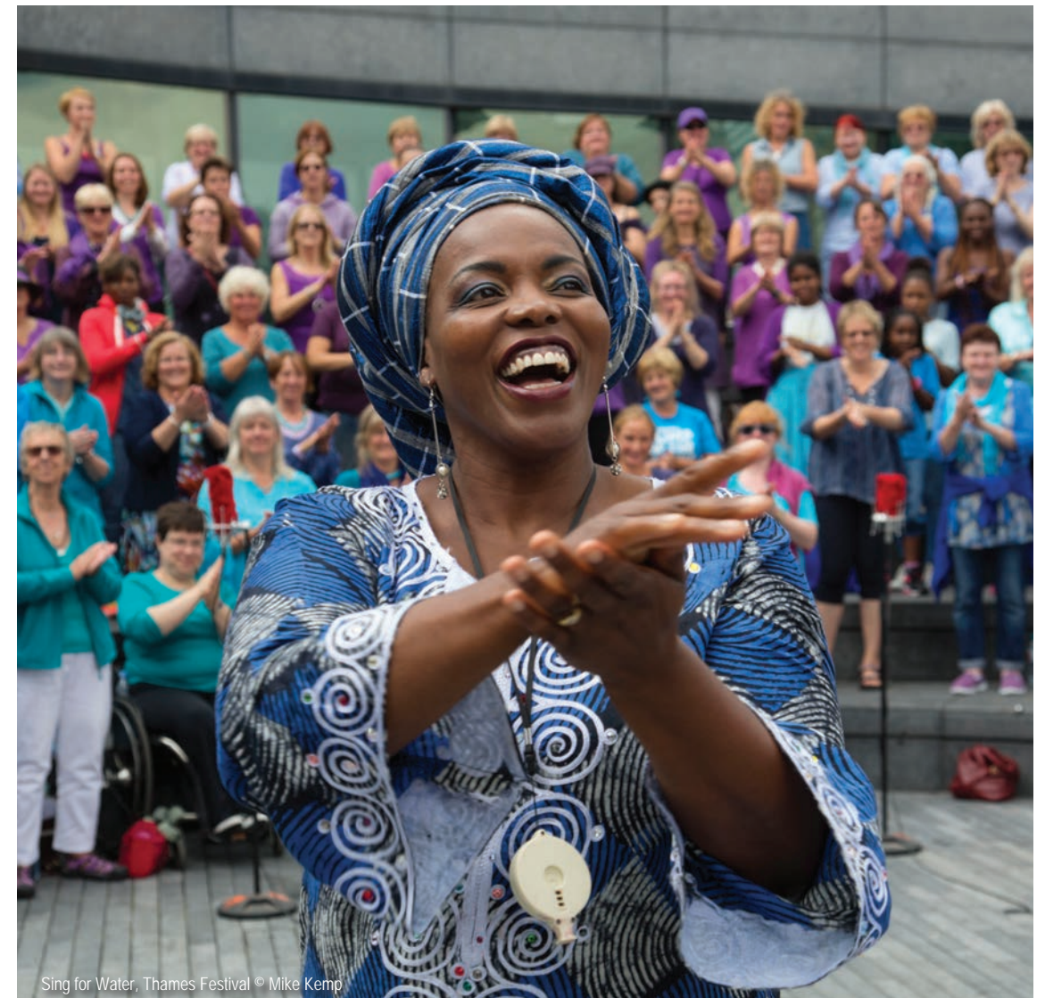
Sing for Water, Thames Festival

Public realm: The look and feel of the high street is a key factor in driving economic growth and providing a welcome to visitors and businesses. Collaborations with artists and the creative community at an early stage of public realm development can help generate a buzz and make your place more distinctive – and ultimately more successful.