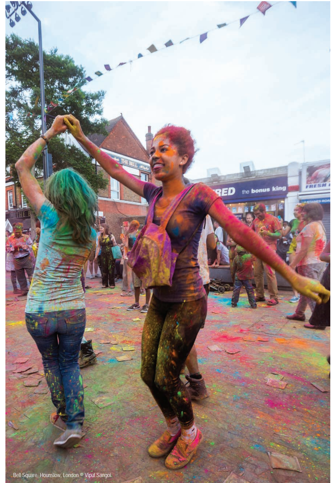
Bell Square, Hounslow, London

Local challenges require local solutions – and partnerships that reflect those unique situations. Among these case studies are useful lessons for BIDs in small towns and big cities, in cultural hubs and places with fewer such amenities. Now more than ever we must address local issues by sharing best practice from across the country and exploring the potential for new partnerships.