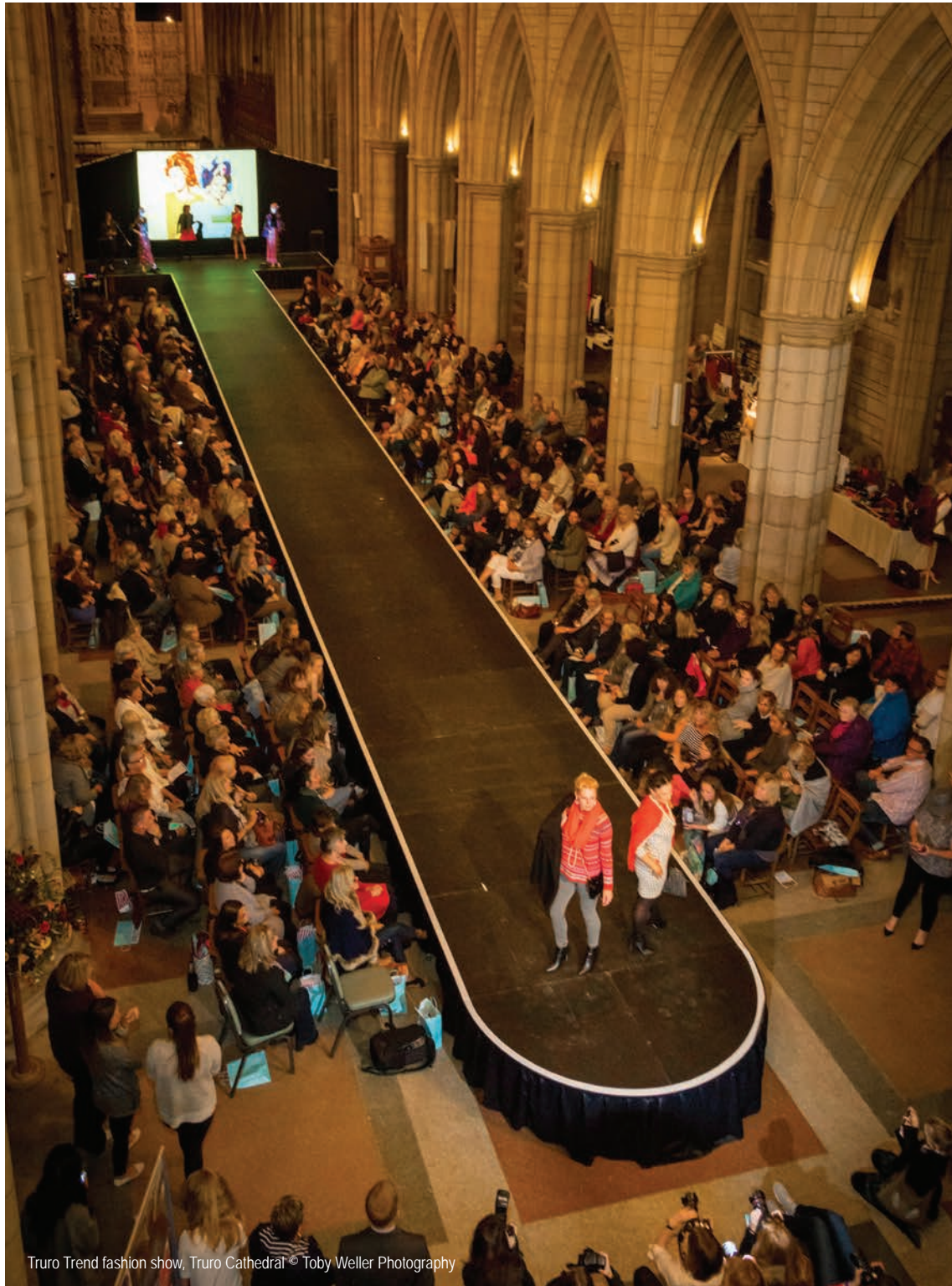
Truro Trend fashion show, Truro Cathedral