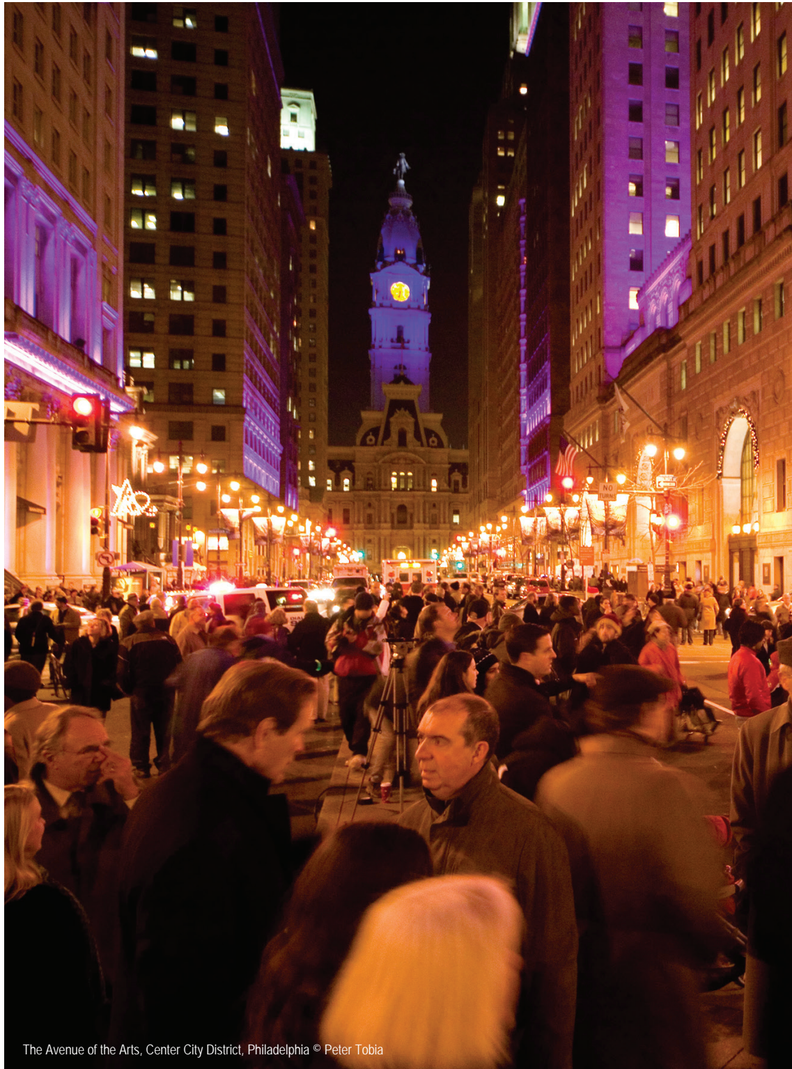
The Avenue of the Arts, Center City District, Philadelphia