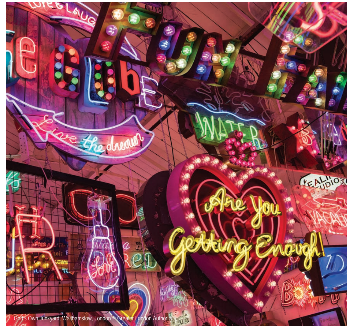
God's Own Junkyard, Walthamstow, London