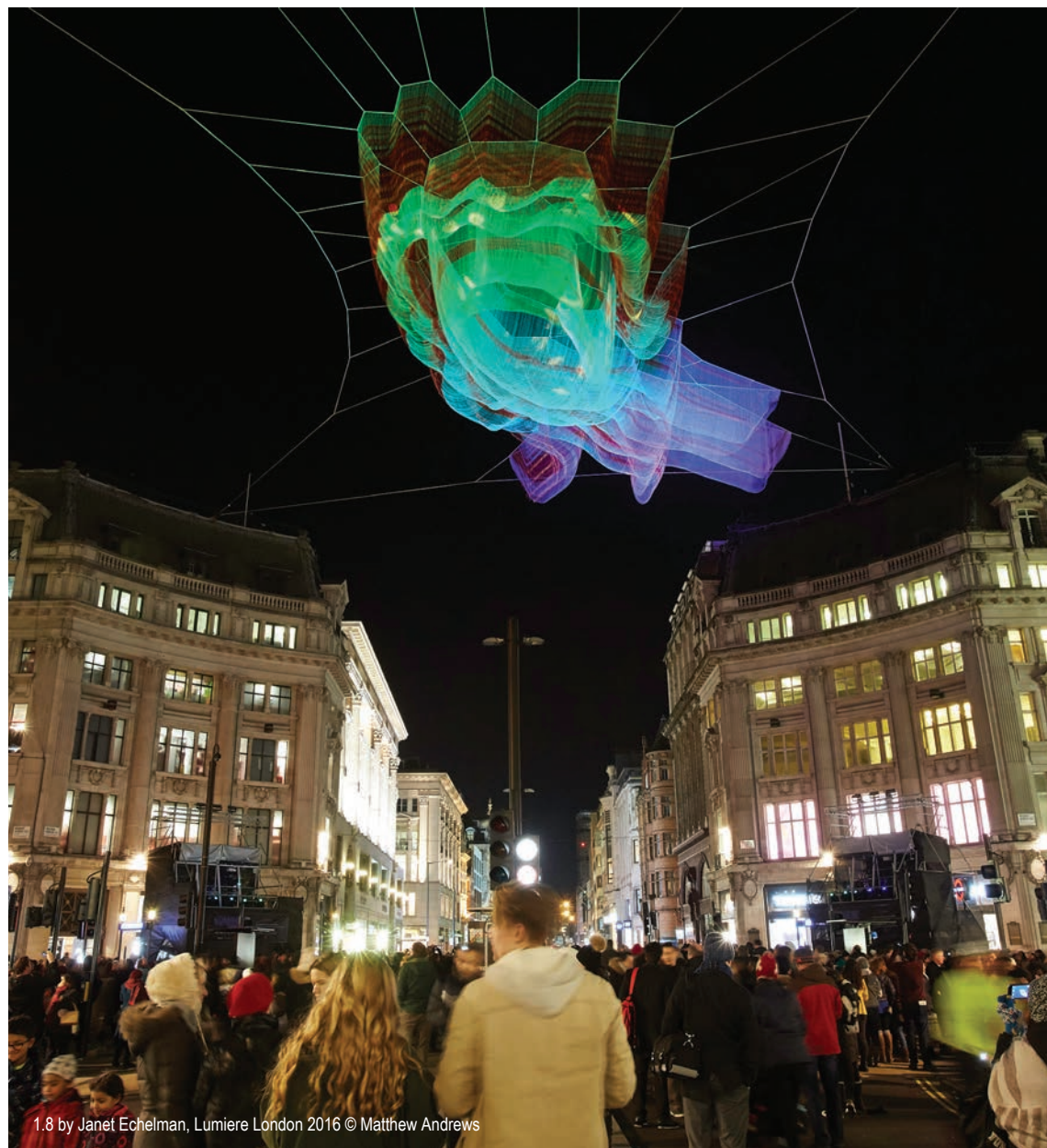
1.8 by Janet Echelman, Lumiere London 2016