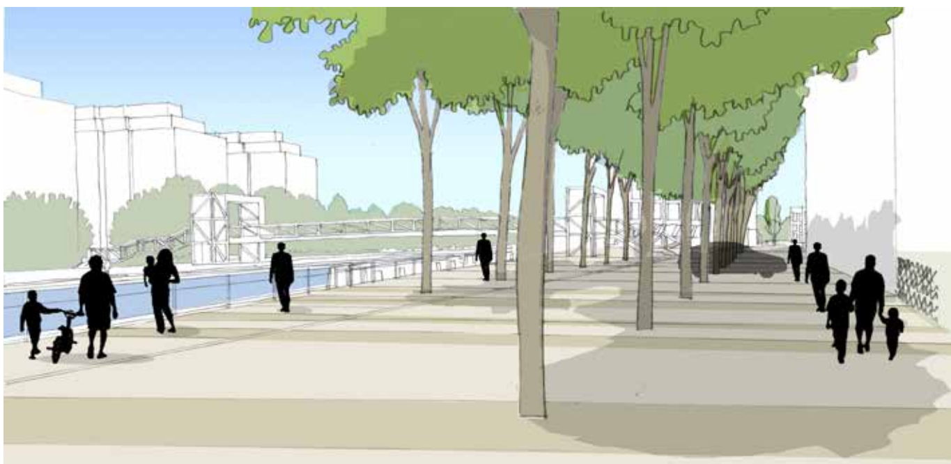
artists impression: wharfside space