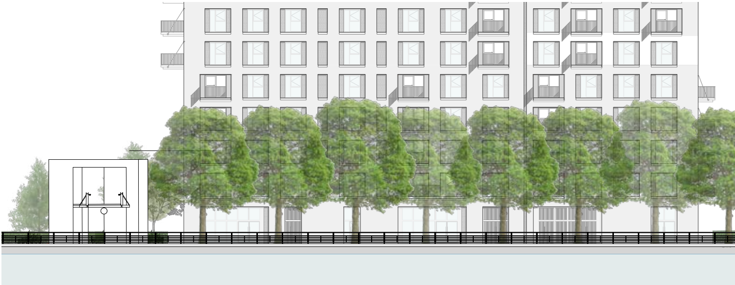
elevation: wharfside landscape