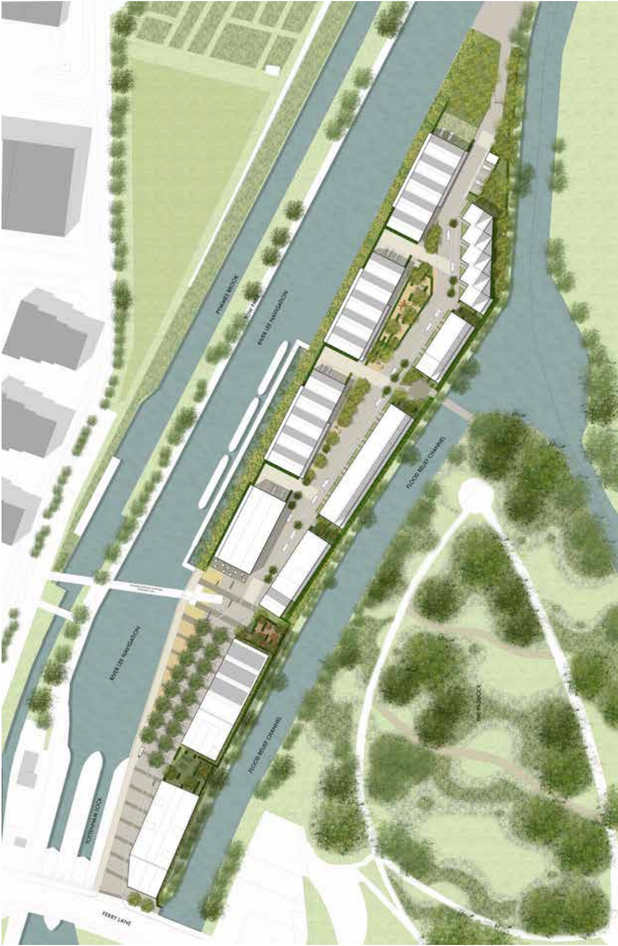
Illustrative landscape masterplan