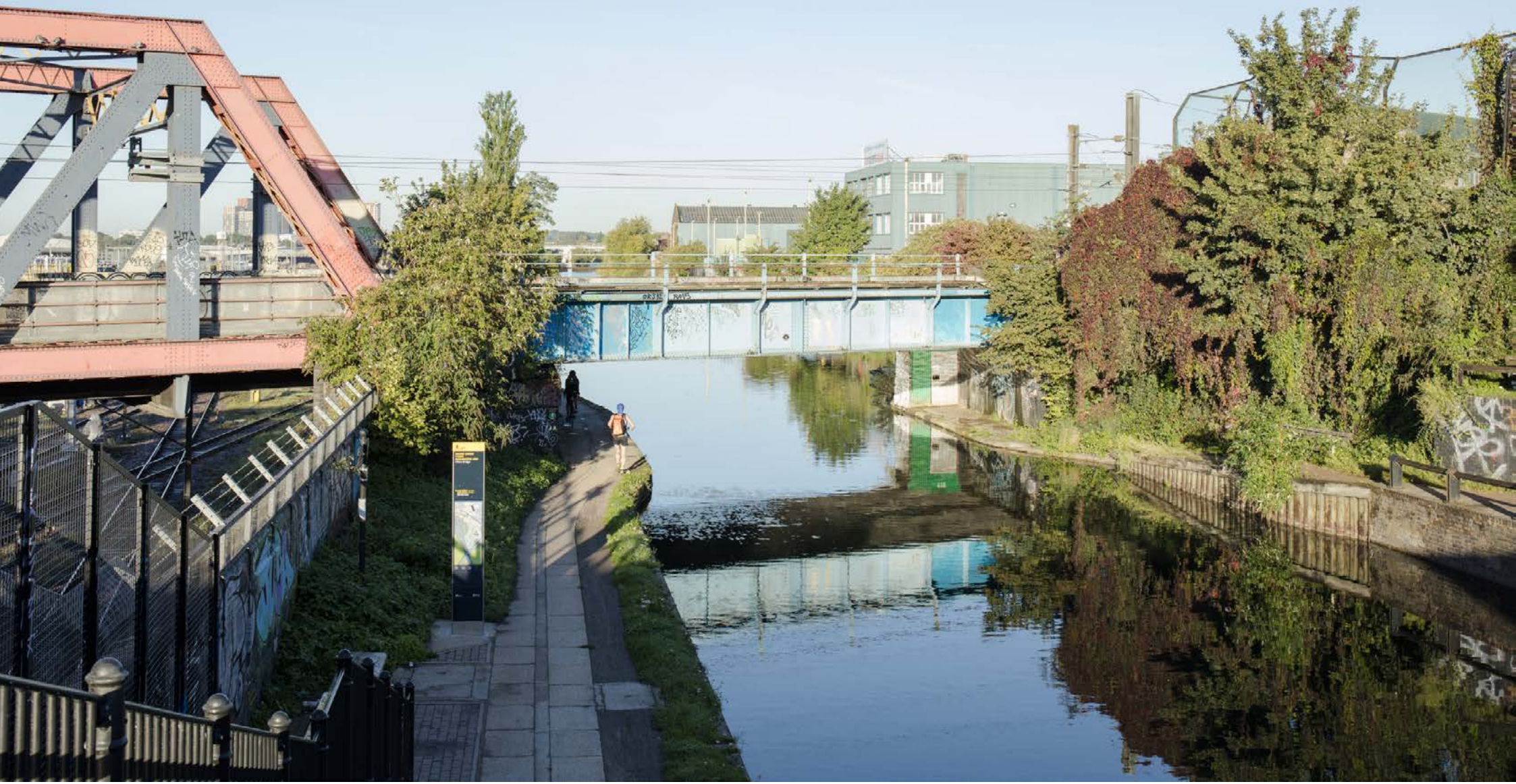
Grand Union Canal viewed west from Mitre Bridge