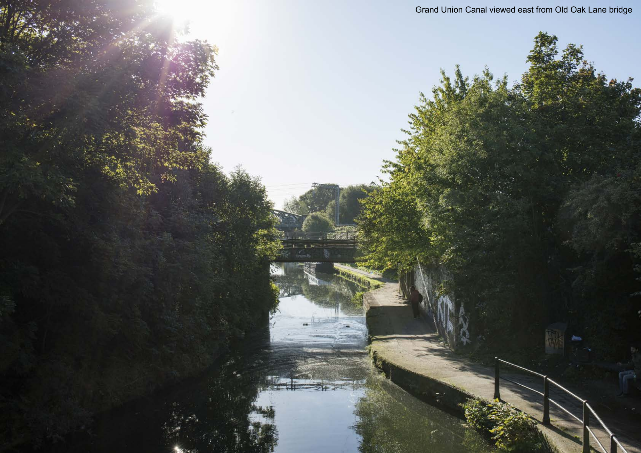
Grand Union Canal viewed east from Old Oak Lane bridge