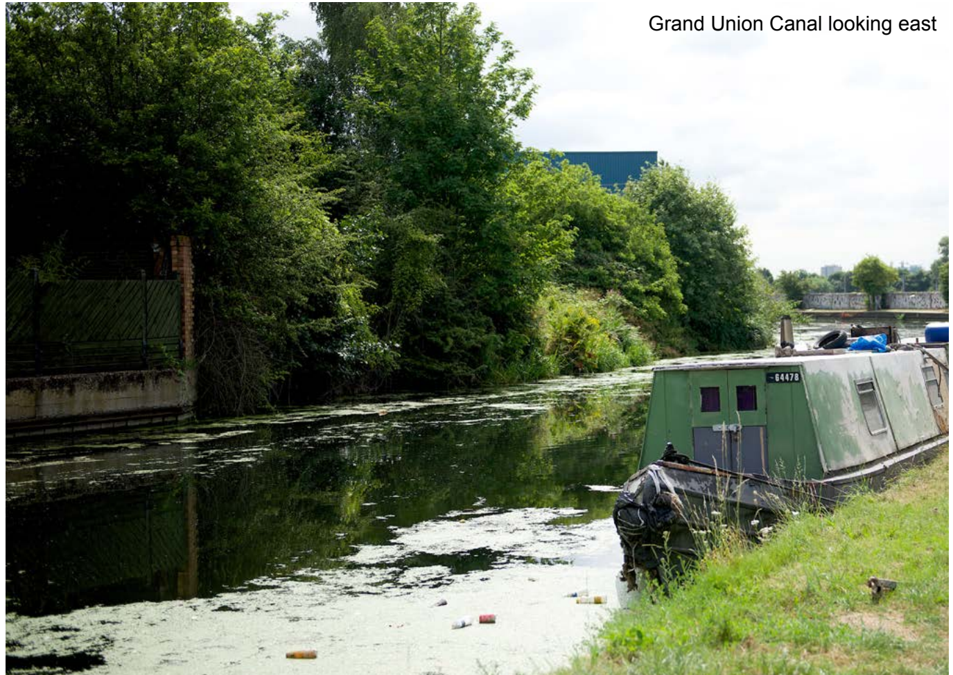
Grand Union Canal looking east

It does not set out information for Strategic Industrial Locations (including the places of Park Royal West and Channel Gate). Building heights and massing along the Grand Union Canal within Park Royal locations will be informed by the need to support industrial intensification alongside all other relevant guidance.