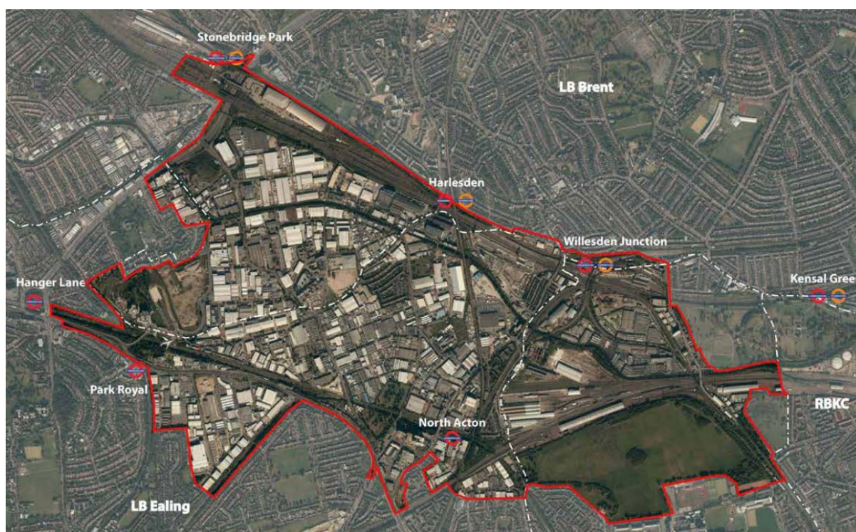
Figure 1 Old Oak & Park Royal Development Corporation boundary

The approach outlined refers to current regulatory requirements and industry best practice for sustainable management and clean up or remediation of contaminated land, and sets out the process for establishing the land contamination strategy for OPDC.