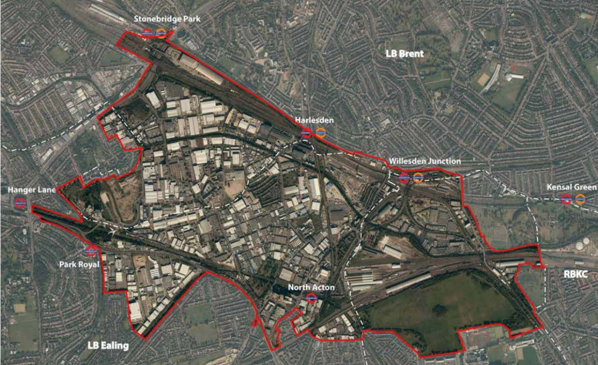
Figure 1 Old Oak & Park Royal Development Corporation boundary

The approach outlined refers to current regulatory requirements and industry best practice for sustainable management and clean up or remediation of contaminated land, and sets out the process for establishing the land contamination strategy for OPDC.