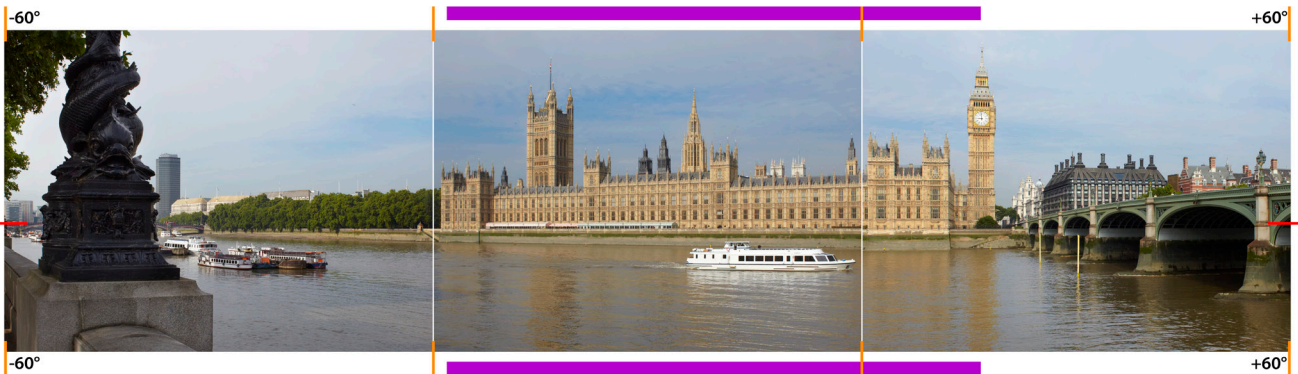
Panorama from Assessment Point 22A.3 Albert Embankment: opposite the Palace of Westminster – at the foot of the steps onto Westminster Bridge