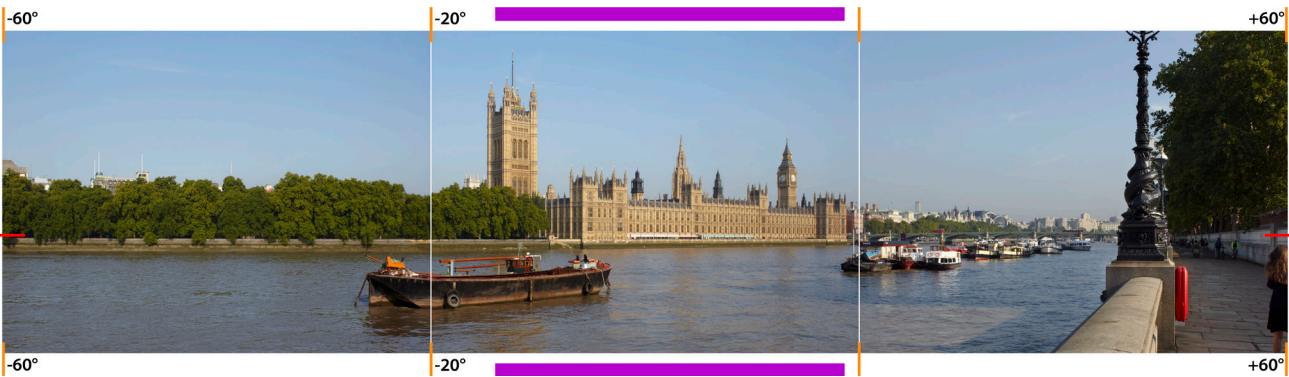
Panorama from Assessment Point 22A.1 Albert Embankment: opposite the Palace of Westminster – approaching from Lambeth Palace