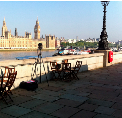
View from Assessment Point 22A.1 Albert Embankment: opposite the Palace of Westminster – approaching from Lambeth Palace (At Orientation board just east of Lambeth Pier). 530538.5E 179140.7N. Camera height 6.17m AOD. Aiming at Palace of Westminster (ventilation tower to south of Central Tower). Bearing 318.1°, distance 0.4km.