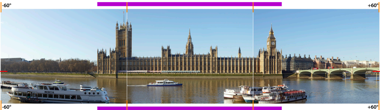
Panorama from Assessment Point 22A.2 Albert Embankment: opposite the Palace of Westminster – axial to the Central Lobby