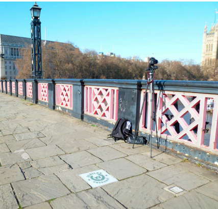
View from Assessment Point 19A.1 Lambeth Bridge: downstream – at the centre of the bridge (northern side of bridge, just west of the centre, looking straight downstream.). 530382.3E 178970.2N. Camera height 13.16m AOD. Aiming at Palace of Westminster (NE finial on northern most tower of river frontage). Bearing 355.7°, distance 0.7km.