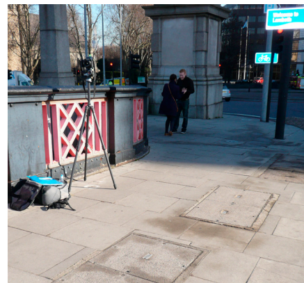
View from Assessment Point 19A.2 Lambeth Bridge: downstream – close to the Lambeth bank (Entering bridge from Lambeth Bank). 530508.9E 178952.1N. Camera height 9.68m AOD. Aiming at Palace of Westminster (The Central Tower, above the lobby crossing). Bearing 335.6°, distance 0.6km.