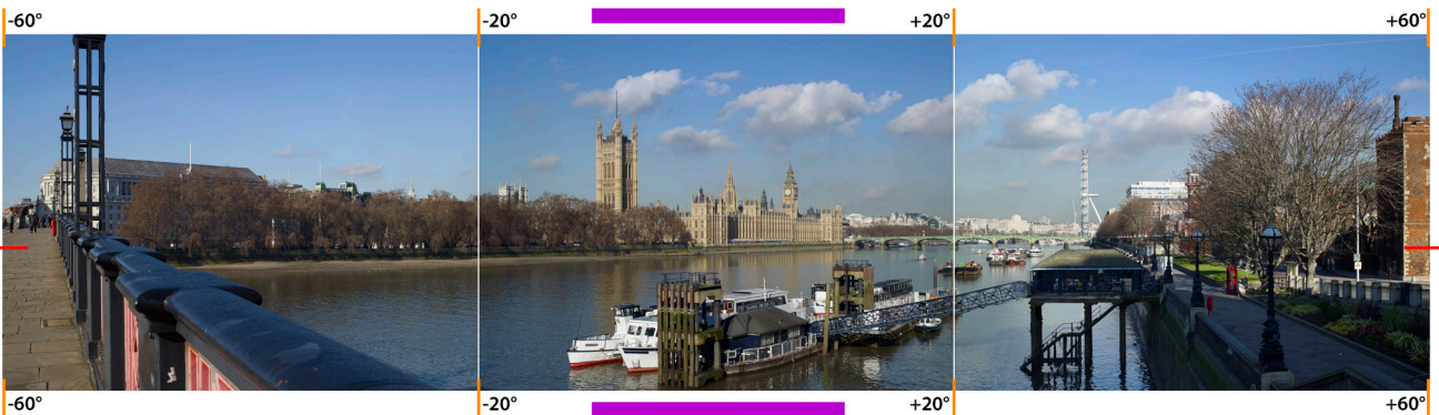
Panorama from Assessment Point 19A.2 Lambeth Bridge: downstream – close to the Lambeth bank