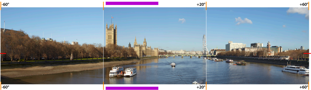
Panorama from Assessment Point 19A.1 Lambeth Bridge: downstream – at the centre of the bridge