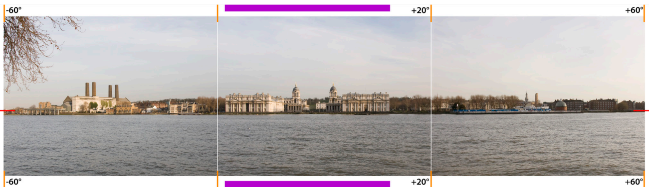
Panorama from Assessment Point 24A.2 Island Gardens: opposite the Royal Naval College – western end of gardens