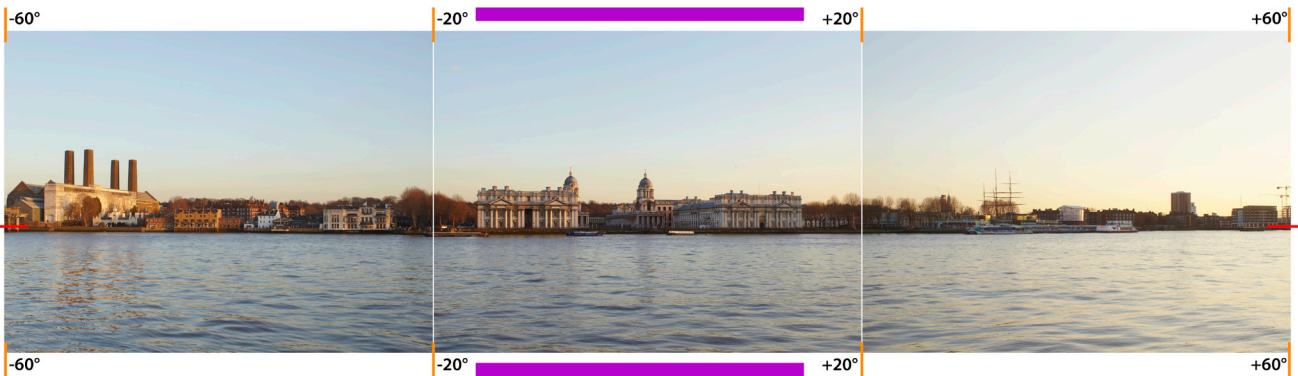
Panorama from Assessment Point 24A.3 Island Gardens: opposite the Royal Naval College – eastern end of gardens