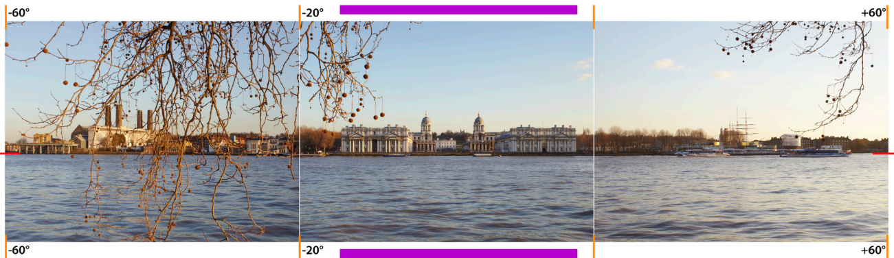
Panorama from Assessment Point 24A.1 Island Gardens: opposite the Royal Naval College – at the orientation board