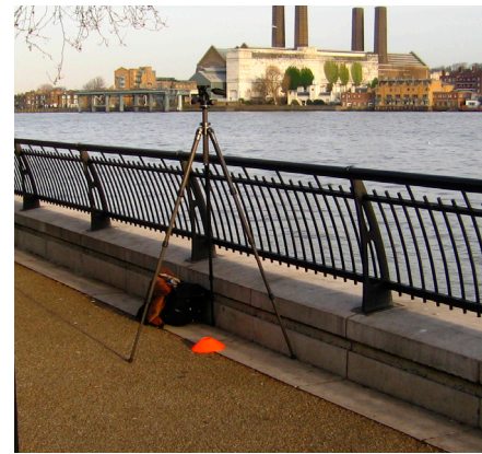
View from Assessment Point 24A.2 Island Gardens: opposite the Royal Naval College – western end of gardens (At rivers edge). 538331.0E 178272.7N. Camera height 6.78m AOD. Aiming at The Queen's House (Central axis of the house; roof ridge line). Bearing 146.6°, distance 0.7km.