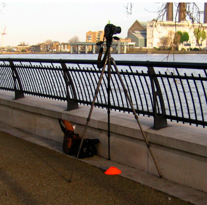
View from Assessment Point 24A.1 Island Gardens: opposite the Royal Naval College – at the orientation board (In front of orientation board). 538392.1E 178295.2N. Camera height 6.70m AOD. Aiming at The Queen's House (Central axis of the house; roof ridge line). Bearing 151.8°, distance 0.7km.