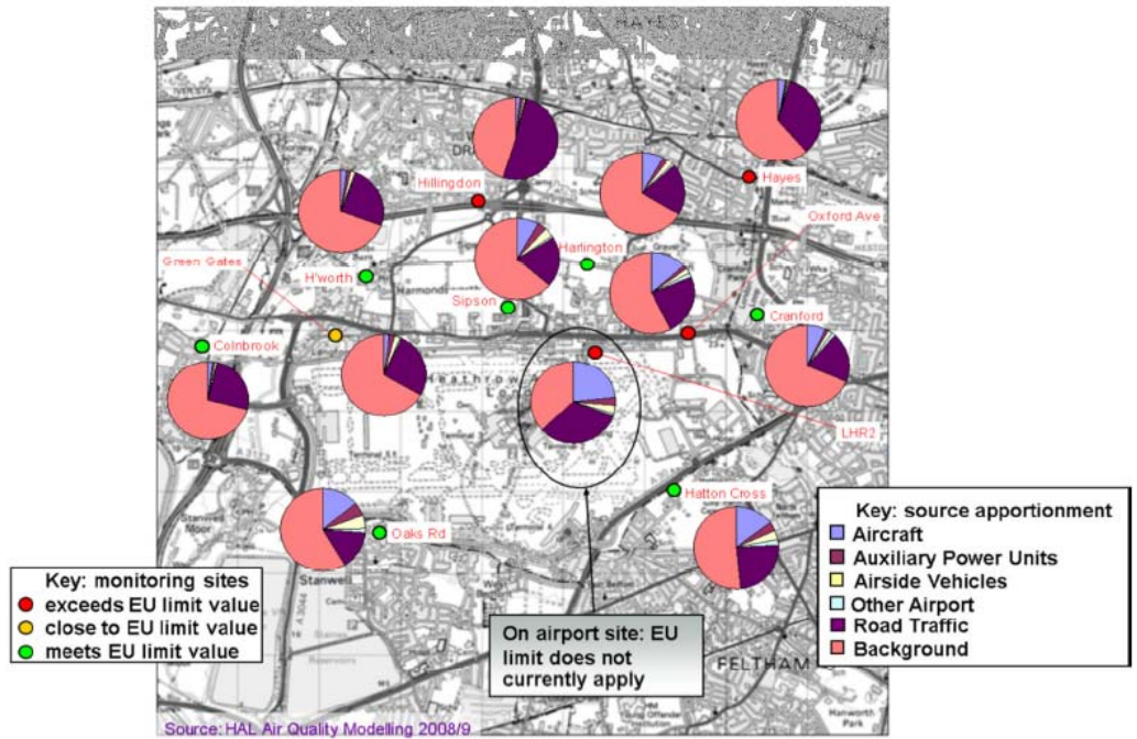
PM10 at LHR2 – Comparison with the 2005 EU limit value (number of days above 50 µg/m 3 )