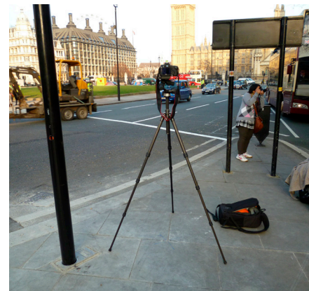
View from Assessment Point 27A.2 Parliament Square: south-west - the traffic island south (east side of island, south of pedestrian crossing). 530076.3E 179582.4N. Camera height 6.41m AOD. Aiming at Palace of Westminster (St Stephen's tower). Bearing 73.3°, distance 0.2km.