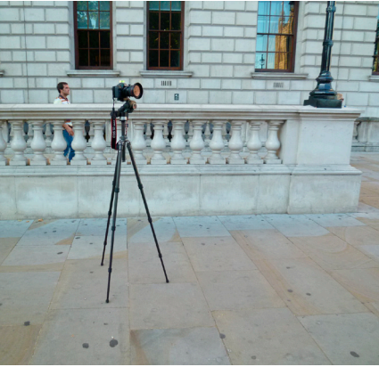
View from Assessment Point 27B.1 Parliament Square: north pavement - entering from St James's Park (centre of pavement, aligned with statues in square). 530087.0E 179686.5N. Camera height 6.68m AOD. Aiming at Palace of Westminster (The Central Tower, above the lobby crossing). Bearing 137.4°, distance 0.3km.