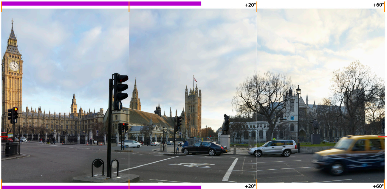
Panorama from Assessment Point 27B.2 Parliament Square: north pavement - entering from Whitehall