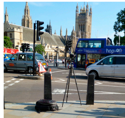
View from Assessment Point 27B.2 Parliament Square: north pavement - entering from Whitehall (between traffic bollards, opposite Churchill Statue). 530137.4E 179683.9N. Camera height 7.02m AOD. Aiming at Palace of Westminster (flagpost on Victoria Tower). Bearing 164.6°, distance 0.3km.