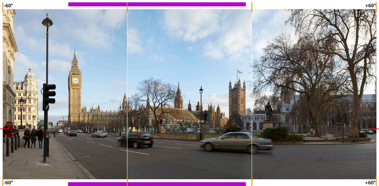
Panorama from Assessment Point 27B.1 Parliament Square: north pavement - entering from St James's Park