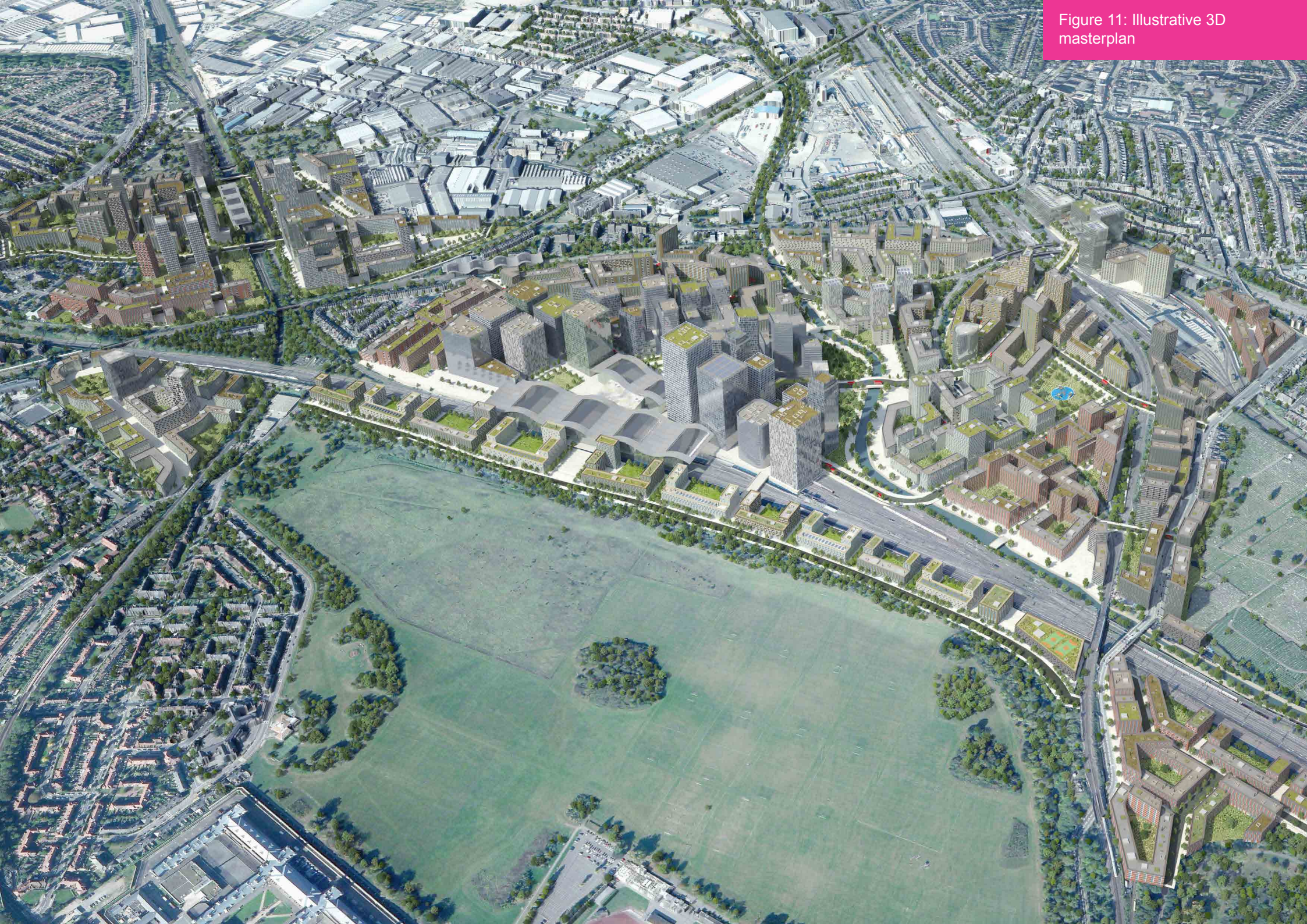
Figure 11: Illustrative 3D masterplan