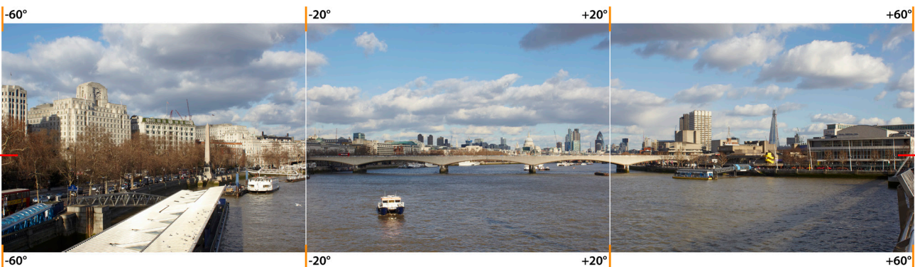
Panorama from Assessment Point 17B.1 Golden Jubilee/Hungerford Footbridges: downstream – crossing the Westminster bank