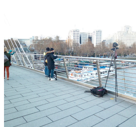
View from Assessment Point 17B.2 Golden Jubilee/Hungerford Footbridges: downstream – close to the Westminster bank (One span towards Westminster bank from centre of bridge, above navigation lights). 530521.7E 180301.9N. Camera height 13.64m AOD. Aiming at St Bride's Church (Centre of steeple; tip of steeple). Bearing 50.9°, distance 1.3km.