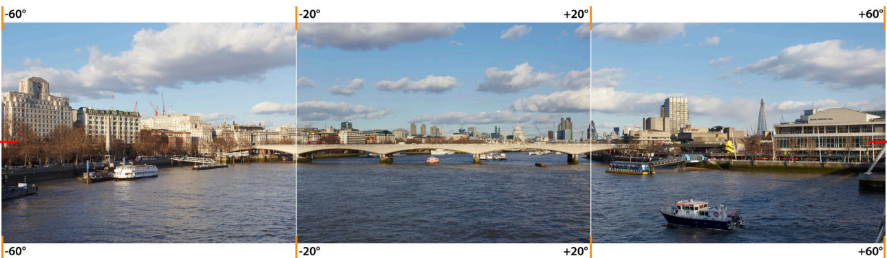
Panorama from Assessment Point 17B.2 Golden Jubilee/Hungerford Footbridges: downstream – close to the Westminster bank