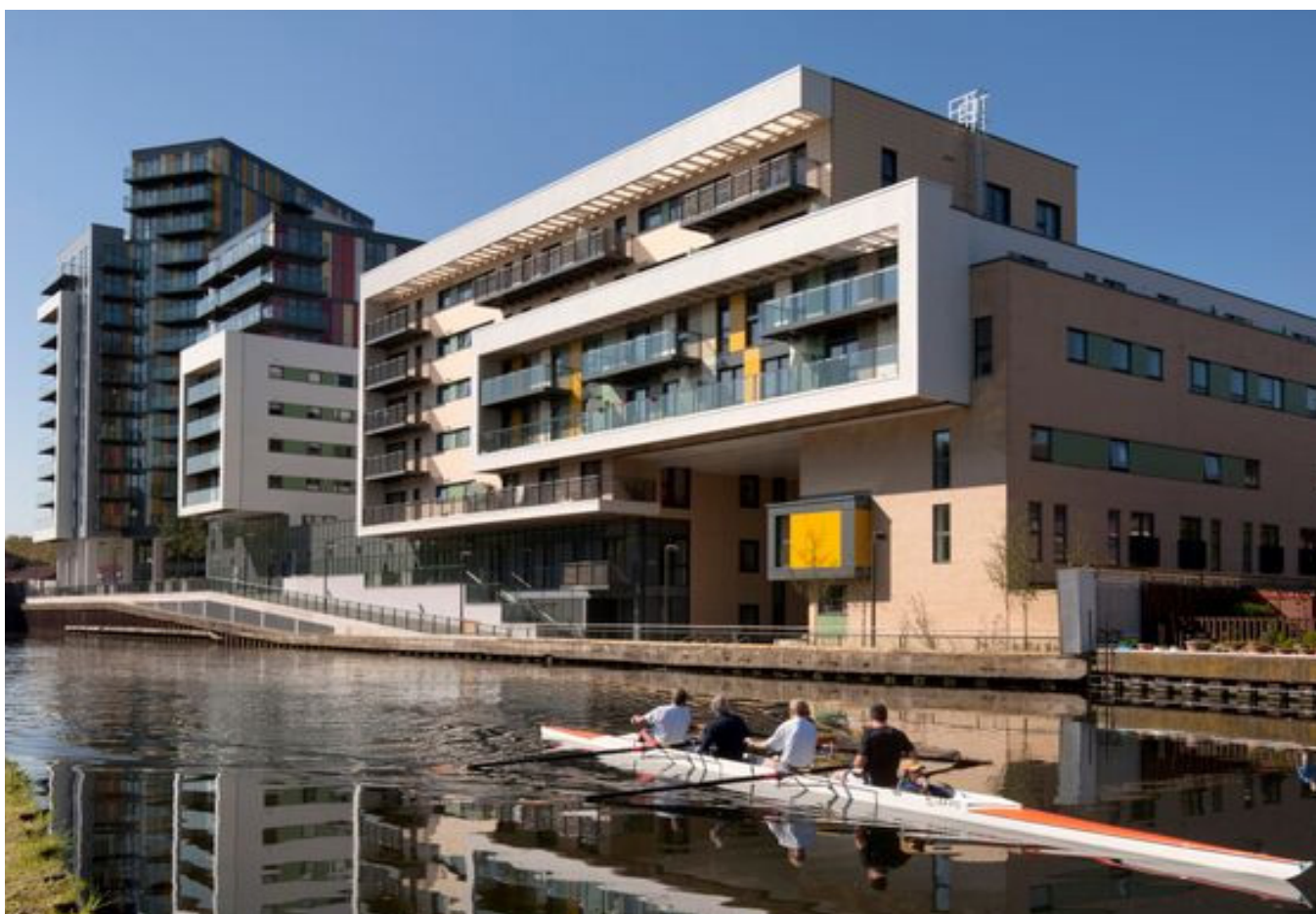
Matchmakers Wharf from the River Lea

Random Dance, a world-class dance company, plans to establish Random Spaces, a professional creative working space that will work with communities in and around the Queen Elizabeth Olympic Park and east London.