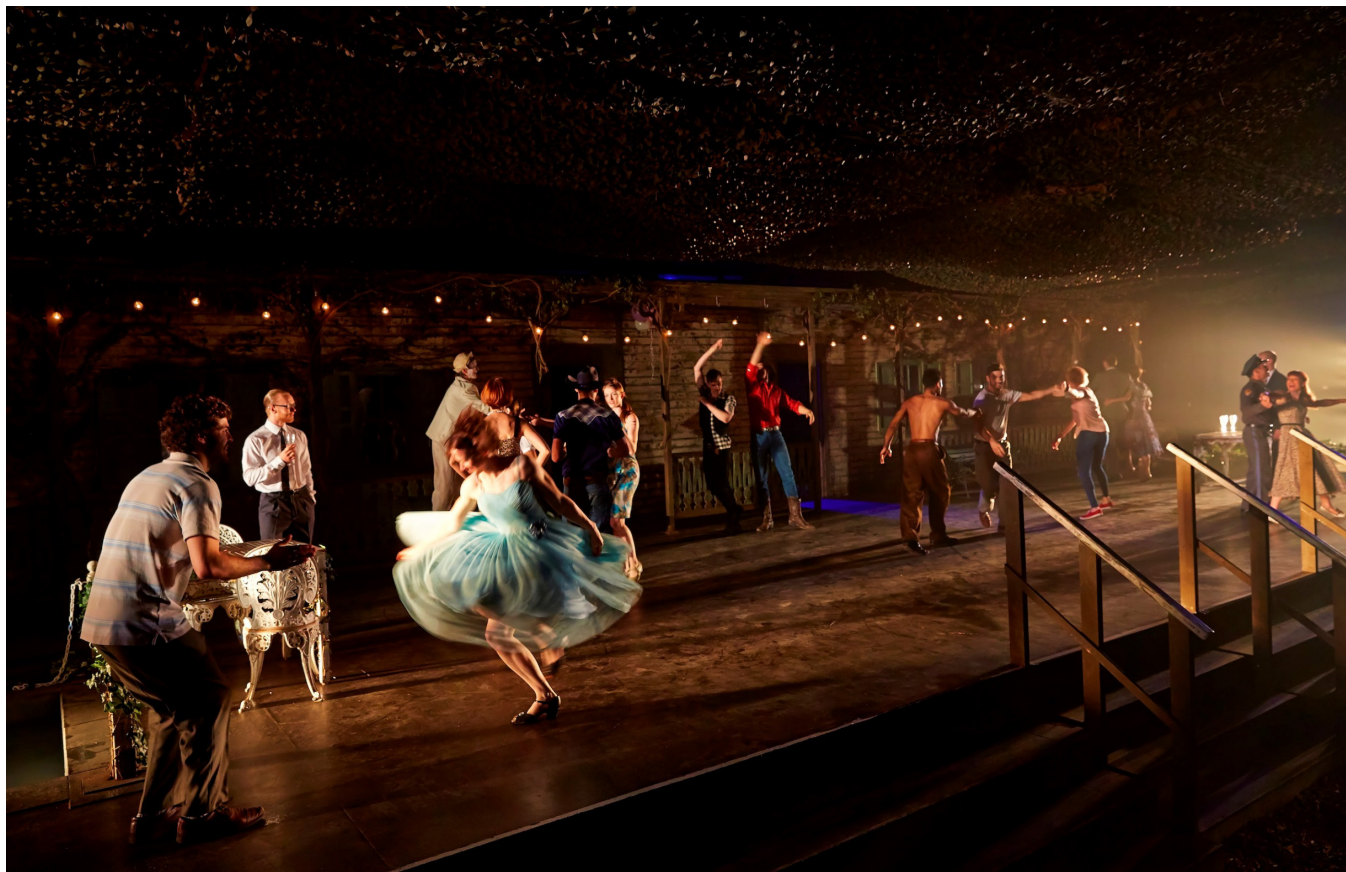
Punchdrunk, The Drowned Man, 2013

Recommendation 12: That our Cultural Vision and Strategy provides for an integrated cultural plan for Old Oak Common station.