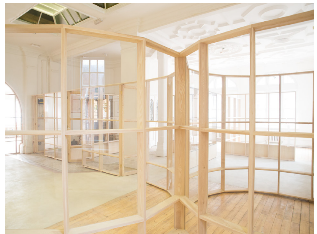
Photos of Old Manor Park Library Creative workspaces

Recommendation 7: That we ensure culture is embedded within our Apprenticeship and Internship programme.