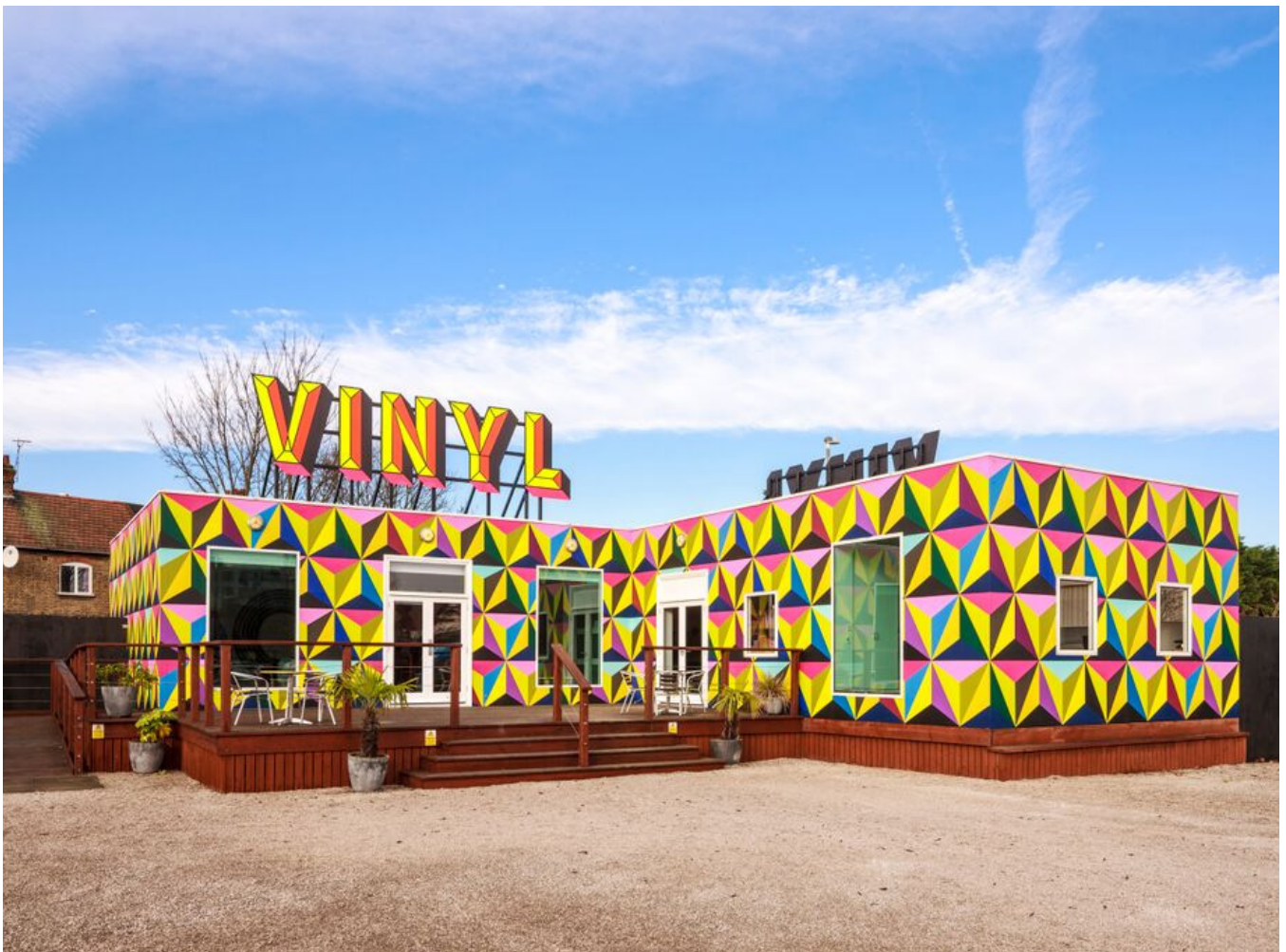
Old Vinyl Factory, Cathedral Group

The £250m redevelopment is a complex, mixed-use masterplan that will