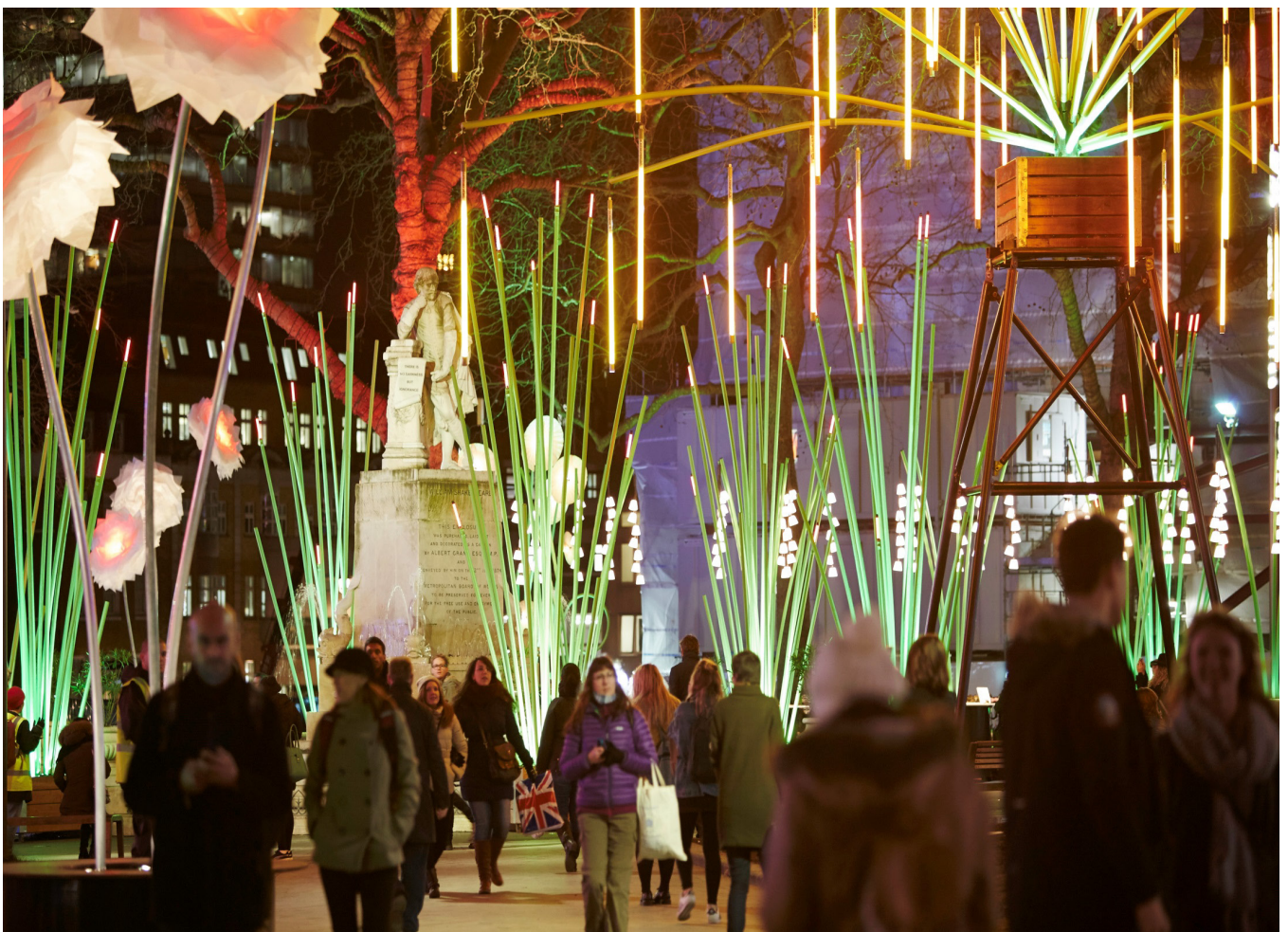
Garden of Light by TILT, Leicester Square, part of Lumiere London

Recommendation 8: That we explore practical ongoing mechanisms for communities to tell us about the culture, character and heritage of their neighbourhoods.