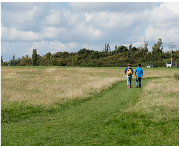
Photos of Wormwood Scrubs

The Markfield Project is also based in the park - a community centre based in the park that promotes rights, in-dependence, choice and inclusion for disabled people and their families.