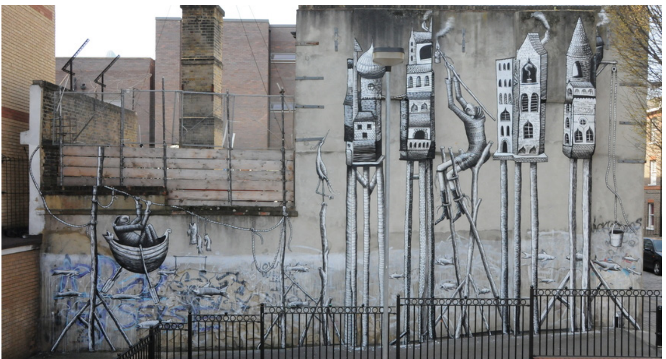
Plegm, organised by Lee Bofkin / Global Street Art

Demand for spaces among artists is very high. Across London, hoardings are increasingly providing legal spaces for street muralists from around the world to practice their art.