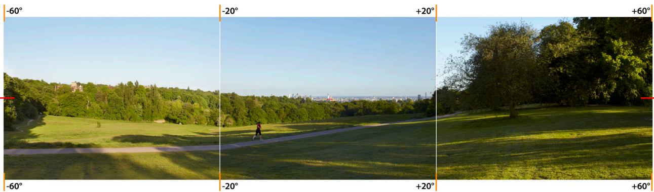
Panorama from Assessment Point 3A.1 Kenwood: the viewing gazebo – in front of the orientation board