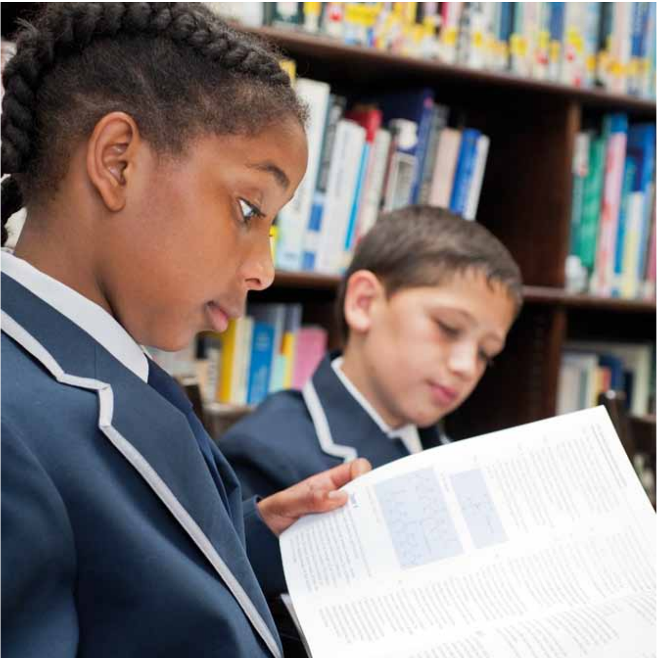
West London Free School pupils.