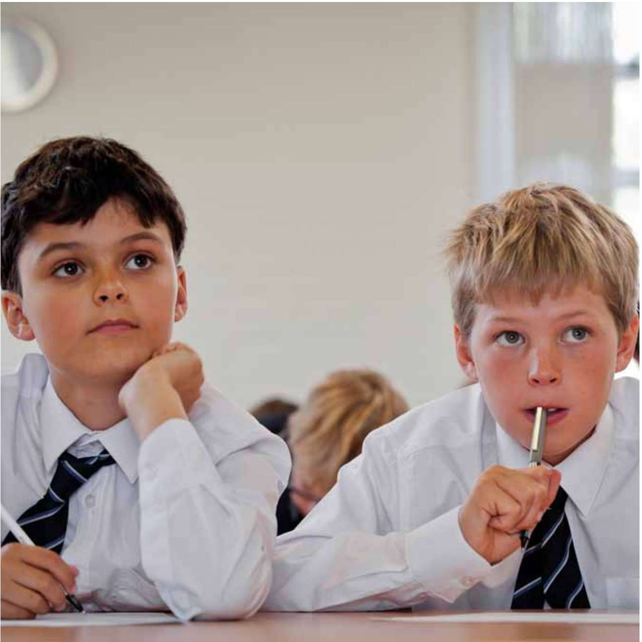
West London Free School pupils.