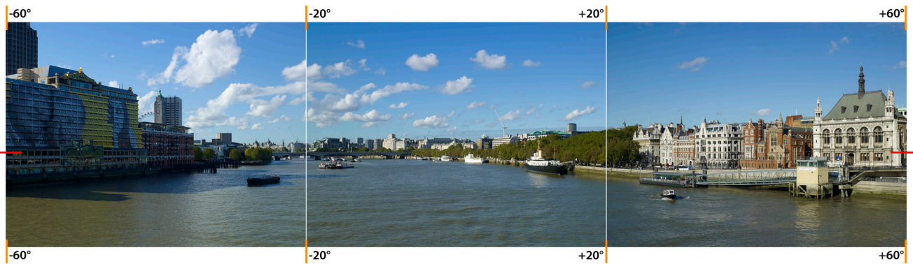
Panorama from Assessment Point 14A.1 Blackfriars Bridge: upstream – at the centre of the bridge