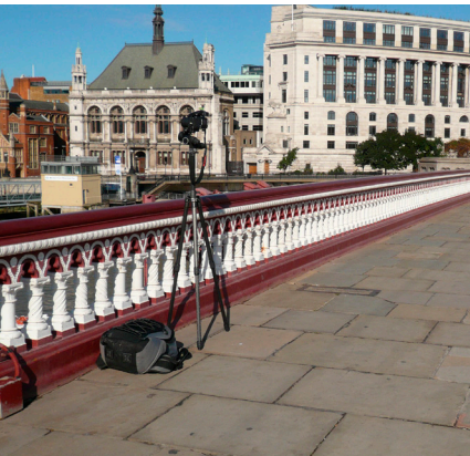
View from Assessment Point 14A.1 Blackfriars Bridge: upstream – at the centre of the bridge (Approximate centreline of bridge). 531629.0E 180698.4N. Camera height 14.50m AOD. Aiming at Somerset House (Flag pole on dome at centre of southern range; top of dome). Bearing 274.4°, distance 0.9km.