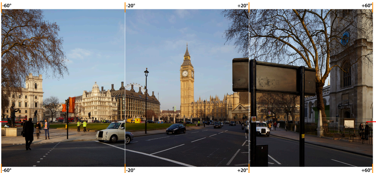
Panorama from Assessment Point 27A.2 Parliament Square: south-west - the traffic island south