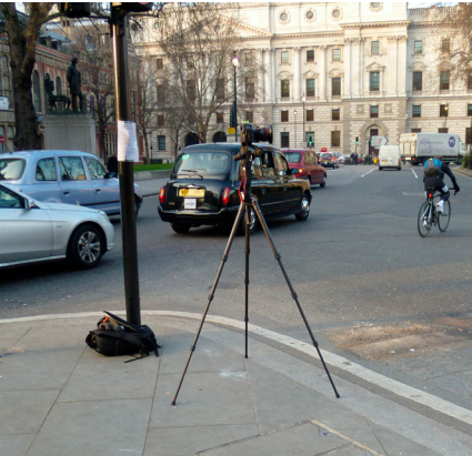
View from Assessment Point 27A.1 Parliament Square: south-west - the traffic island north (apex of island, north of pedestrian crossing). 530066.5E 179590.7N. Camera height 6.59m AOD. Aiming at Palace of Westminster (St Stephen's tower). Bearing 76.2°, distance 0.2km.