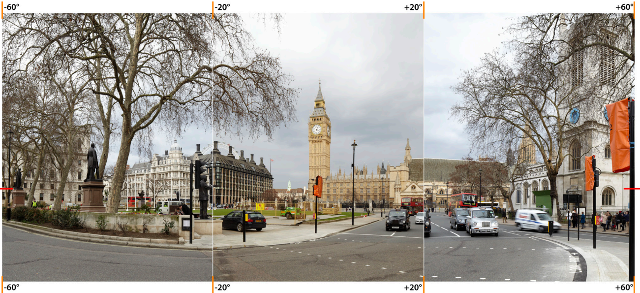
Panorama from Assessment Point 27A.1 Parliament Square: south-west - the traffic island north