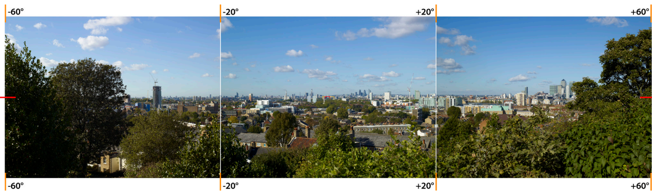
Panorama from Assessment Point 6A.1 Blackheath Point – near the orientation board