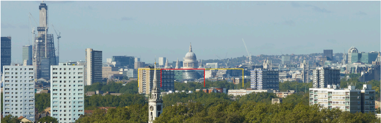
Telephoto view of Protected Vista from Assessment Point 6A.1 to St Paul's Cathedral