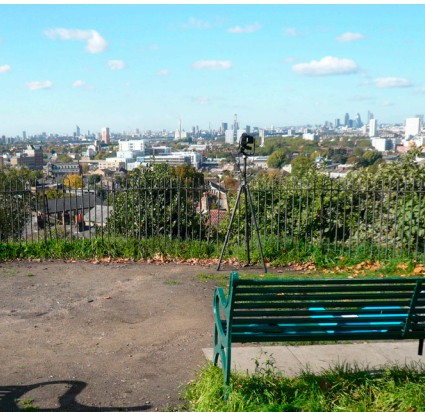
View from Assessment Point 6A.1 Blackheath Point – near the orientation board (West of the orientation board, close to the railings). 538238.2E 176823.1N. Camera height 47.61m AOD. Aiming at St Paul's Cathedral (Central axis of the dome, at the base of the drum). Bearing 304.9°, distance 7.5km.