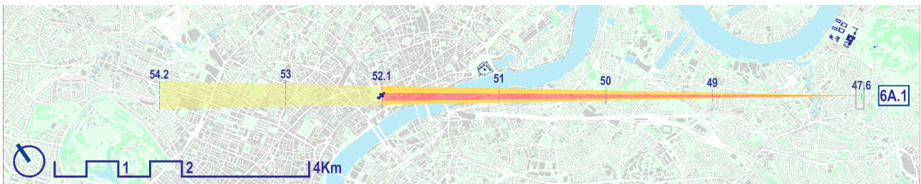
Annotated map of Protected Vista from Assessment Point 6A.1 to St Paul's Cathedral