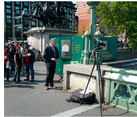
View from Assessment Point 18B.1 Westminster Bridge: downstream – at the Westminster bank (At head of stairs leading up from Victoria Embankment). 530339.0E 179677.9N. Camera height 10.36m AOD. Aiming at The London Eye (Western tip of axis of wheel). Bearing 65.0°, distance 0.6km.