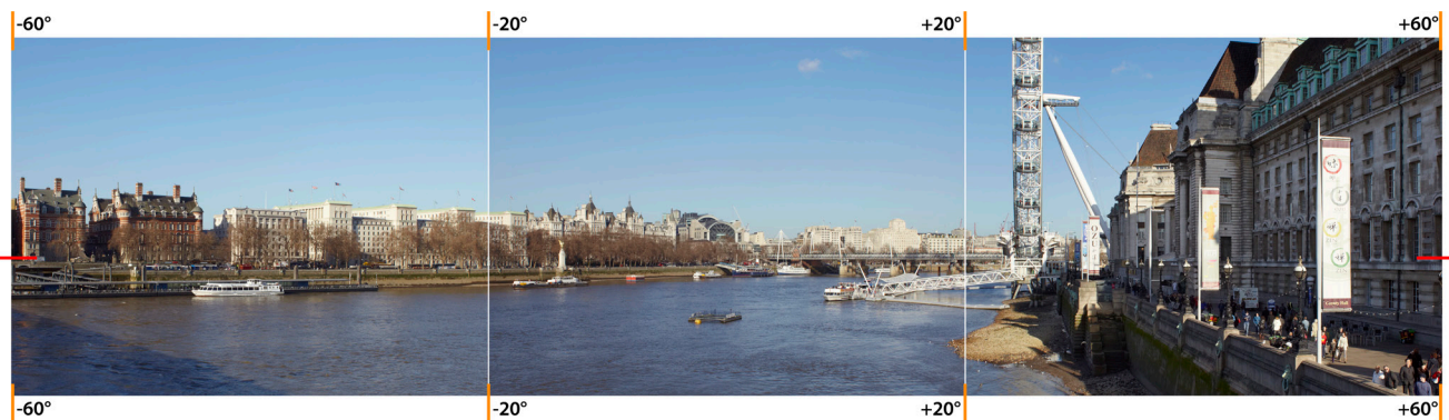
Panorama from Assessment Point 18B.2 Westminster Bridge: downstream – at the Lambeth bank