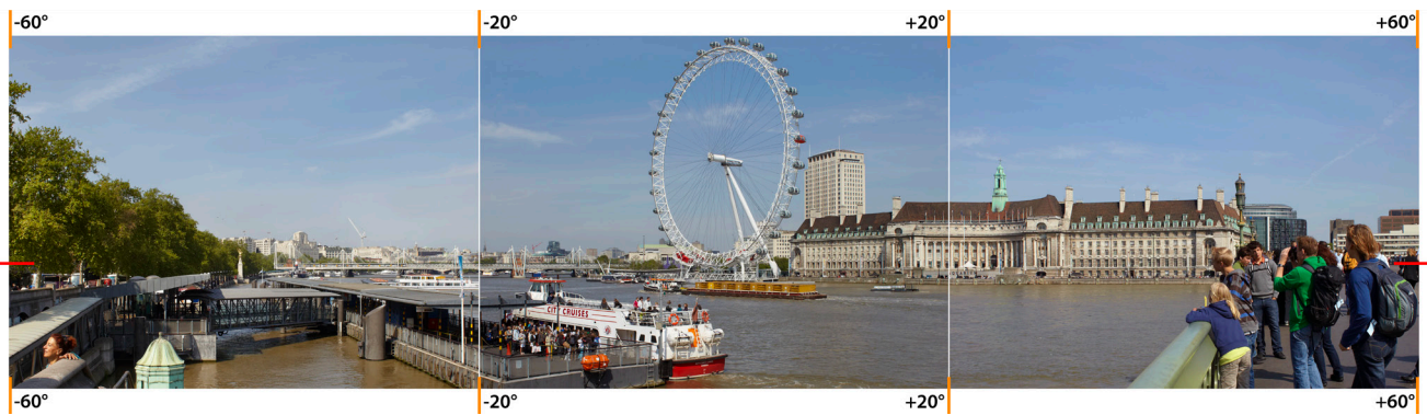
Panorama from Assessment Point 18B.1 Westminster Bridge: downstream – at the Westminster bank