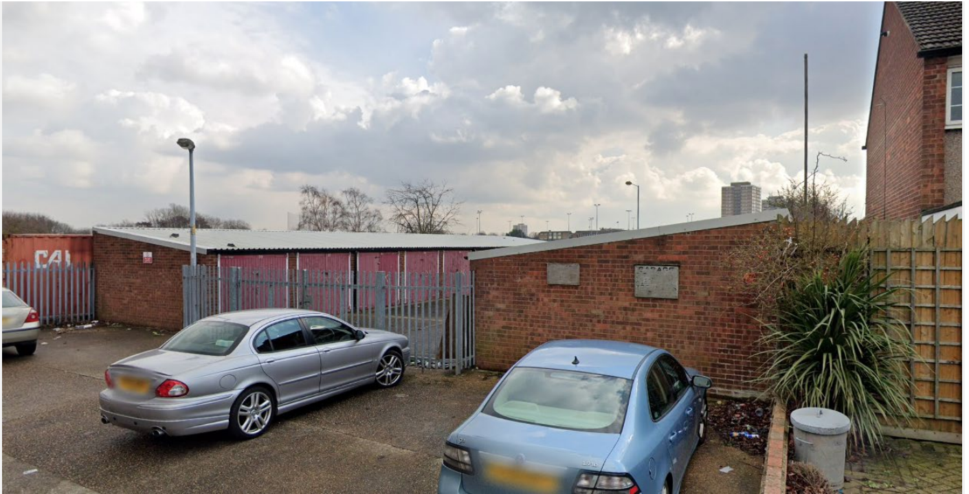
Figure 2: Google streetview of site (image captured 2018)

Garages and car parking are sui generis uses. There are no local or regional planning policies which specially deal with the loss of garages; therefore, their loss will be considered on a case-by-case basis. It is advised that the existing occupancy rates for this site are confirmed by LBBD to understand how intensively the site is used.