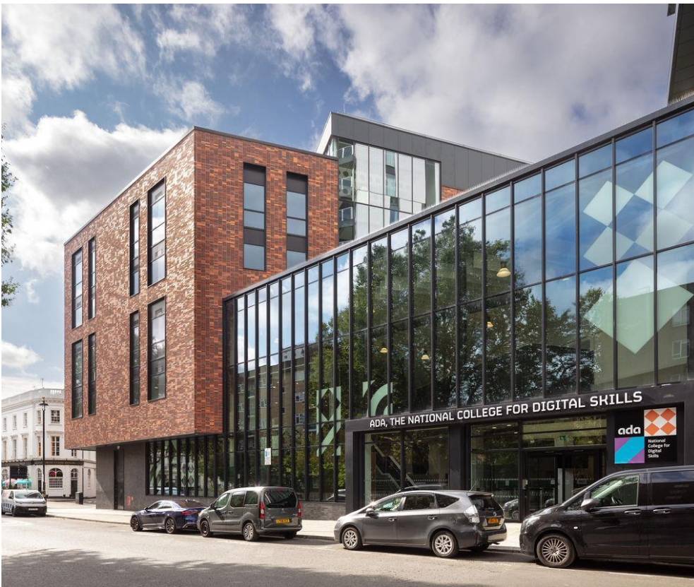
Image: The Ada, National College for Digital Skills building

Ada have co-designed their curriculum in partnership with leading tech companies. Their 137 sixth form students take one of three pathways, each of which reflects an in-demand skillset within the tech industry. At the core of their curriculum is the BTEC Level 3 National in Computing. Alongside this, students study pathway-specific qualifications, with a choice of A Levels that includes further Computer Science units. All pathways are equivalent to three A Levels, allowing students to progress to either a University Degree, a Degree Apprenticeship or their dream job in tech.