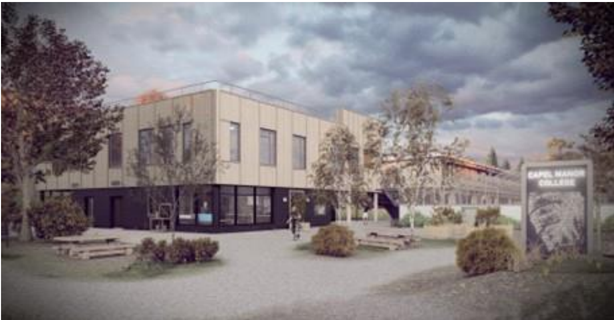
Image: Capel Manor College – Mottingham Campus Redevelopment – Architects Impression

The Mottingham campus redevelopment is expected to be completed in September 2024.