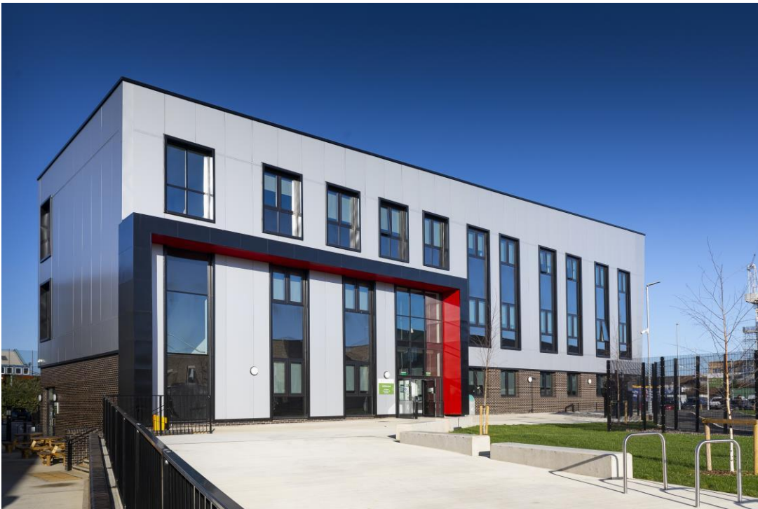
Image: New City College Rainham Construction Infrastructure Skills and Innovation Centre (CISIC) building

The project was completed in 2022 and aims to support more than 8,000 learners over five years post-practical completion, with 660 apprenticeship starts and delivery of multiple other skills/employment-related outputs, as well as cost savings for the college.