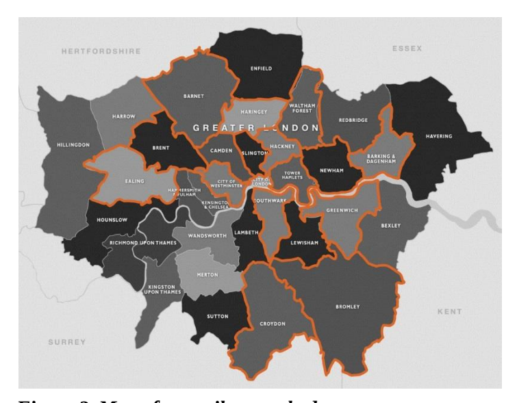
Figure 2. Map of councils consulted