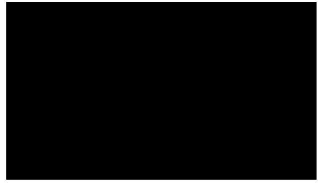
Mayor's Design Advocate