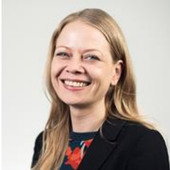
Sian Berry AM Chair of the Transport Committee

Sadiq Khan, Mayor of London (Sent by email)