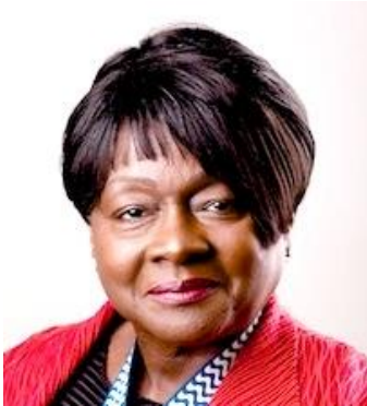
Jennette Arnold OBE AM Chair of the Education Panel

Gavin Williamson Secretary of State for Education (Sent by email)