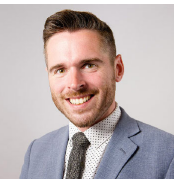
Tom Copley AM Labour