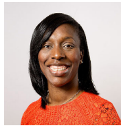
Florence Eshalomi AM MP Labour