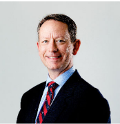
Gavin Bacon AM MP Conservative